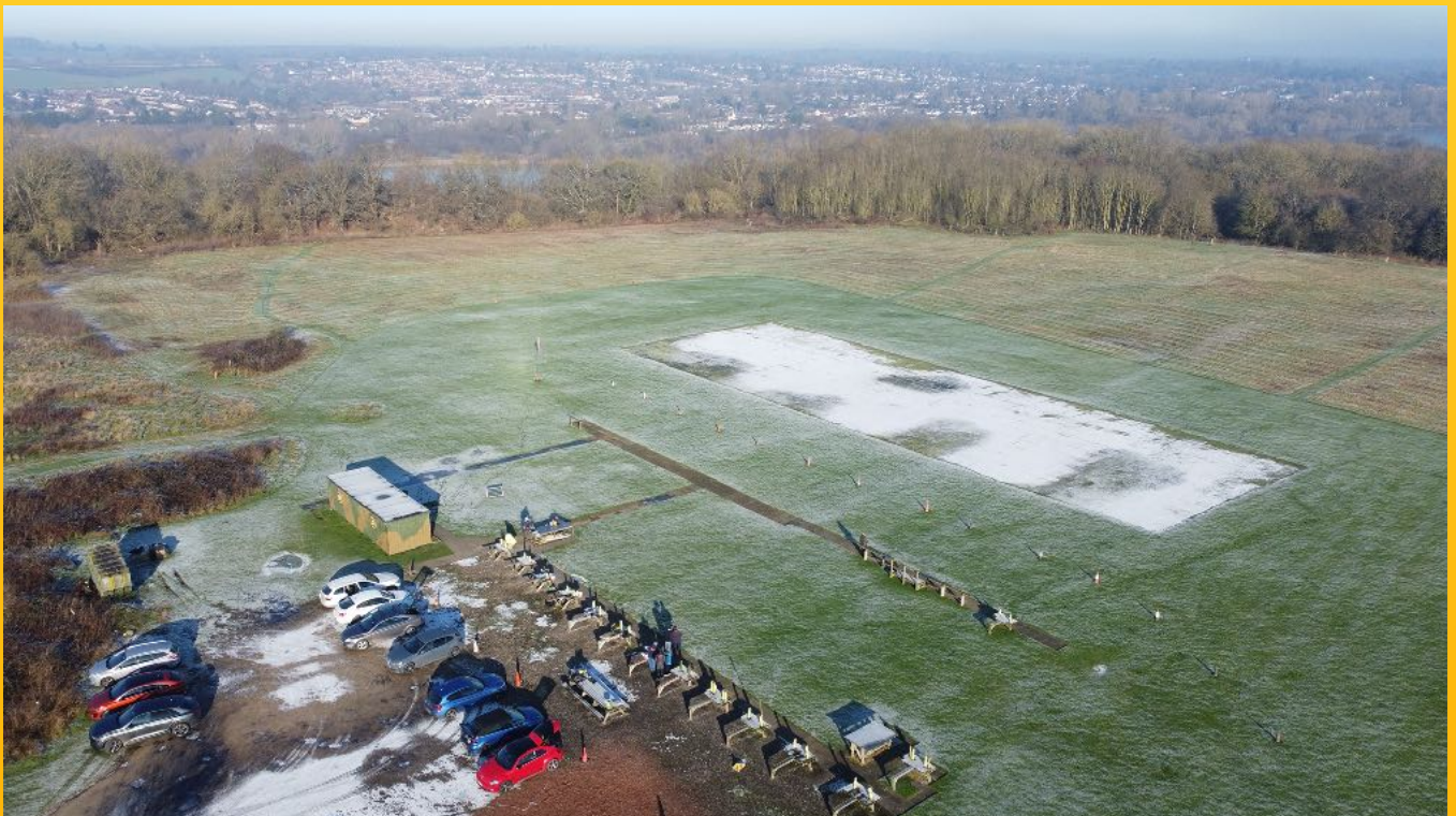
The Club enjoyed a good turnout, despite the cold in early January.