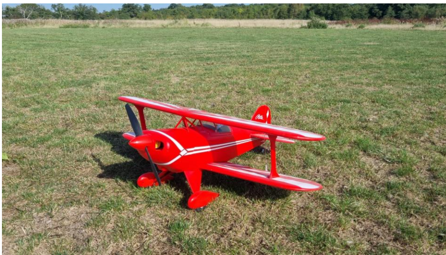
Jonathan Blewett's Pitts at Pickeridge. Lovely day for it. 5 batts and plane with little wheels, not a problem.

Keys have been purchased for the new lock of the main door. So, if you have an old key please arrange with Felix about obtaining one (you can dispose of the original).