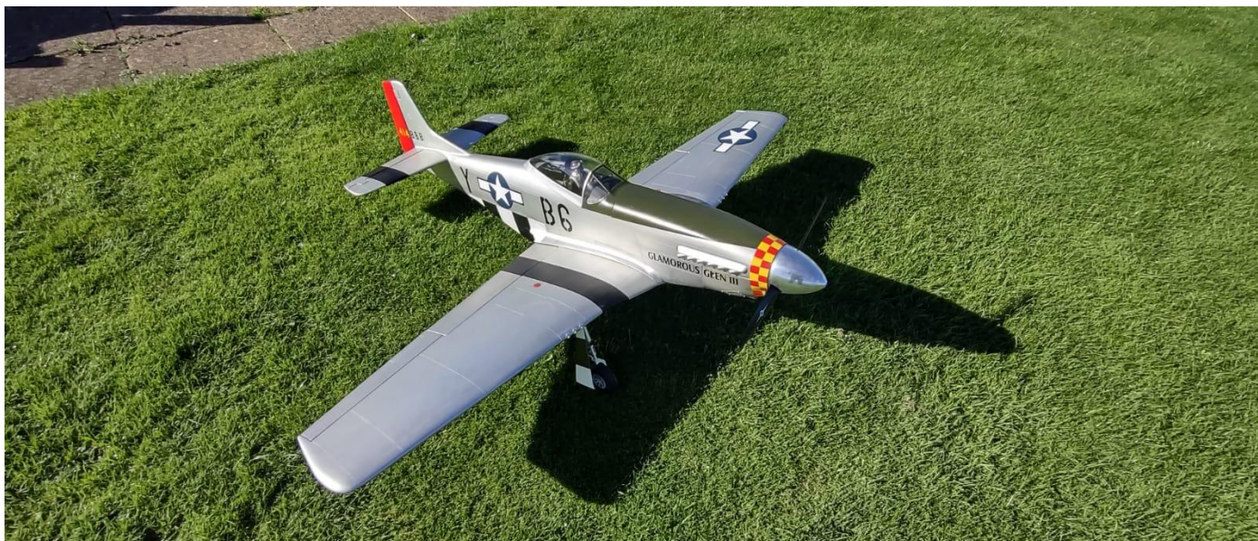
Very nice example of a Toplite Mustang by Richard Saunders just before its maiden flight.

Well, 2023 is slowly coming to an end, the weather is all over the place but this is not holding members back with plenty of flying at the fields and related activities. Also, indoor flying is now well under way.