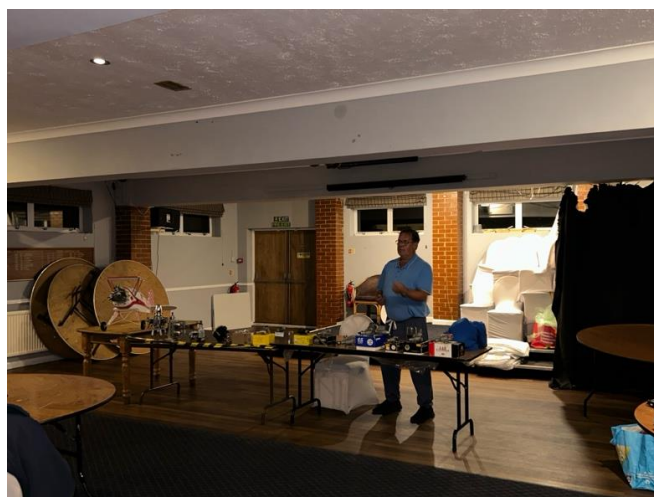
Think we need some extra lighting next time (or a flash)?