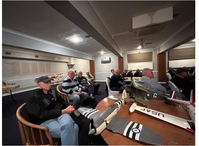
Nice to see many members attending the talk.