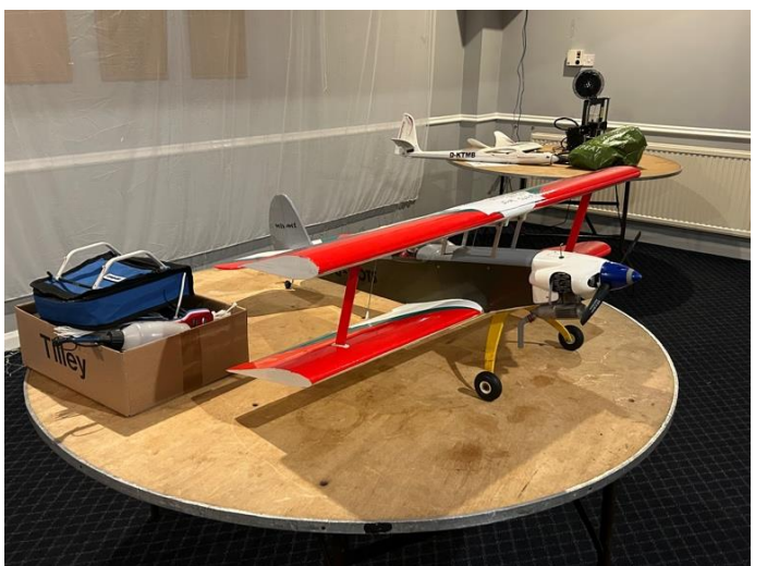
Bring and buy items.