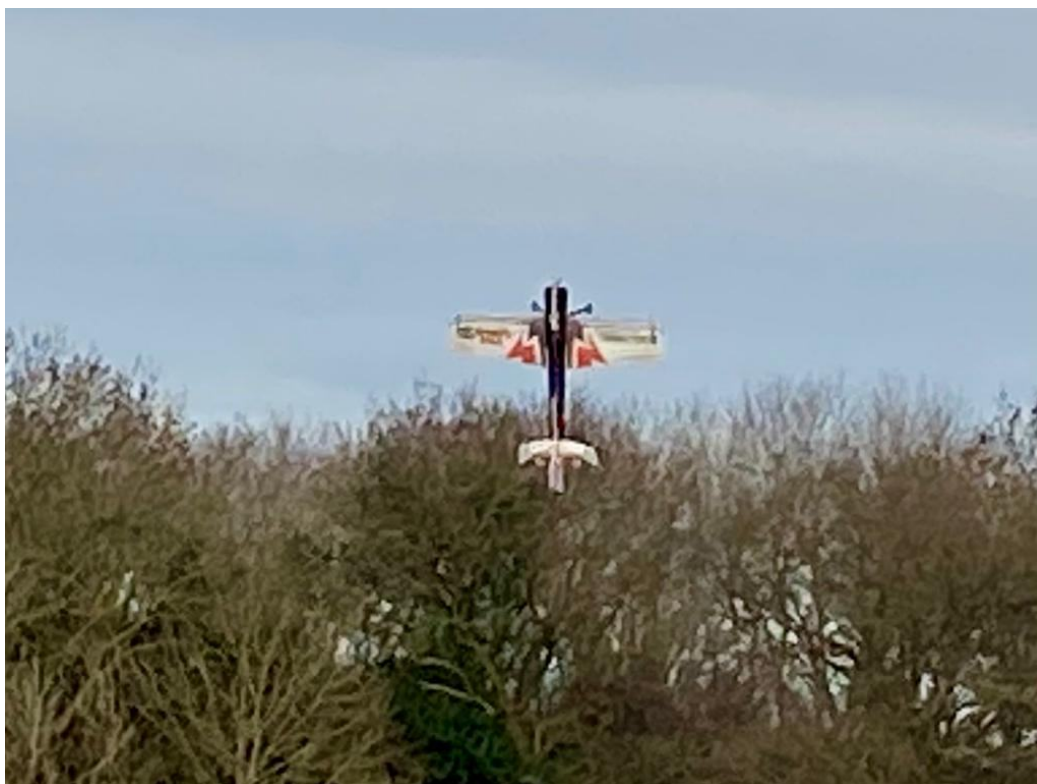
Mat putting the Sbach through a bit of prop hanging.

All Events cancelled at present but list below kept open in the hope that things will change soon.