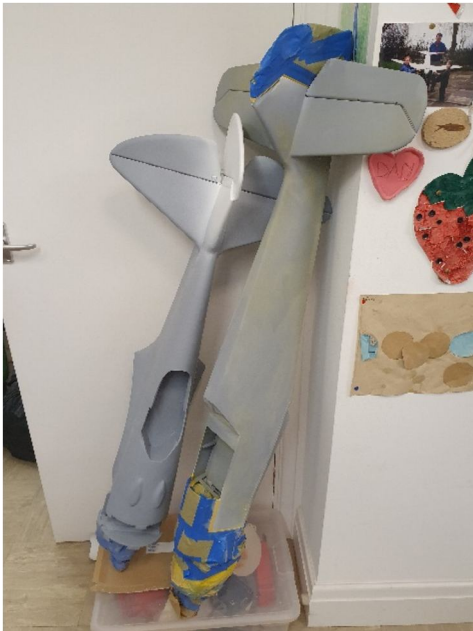
Ready for topcoat