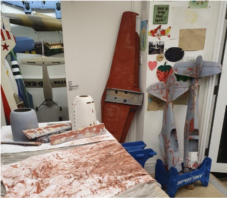
2 models prepared and ready for undercoat