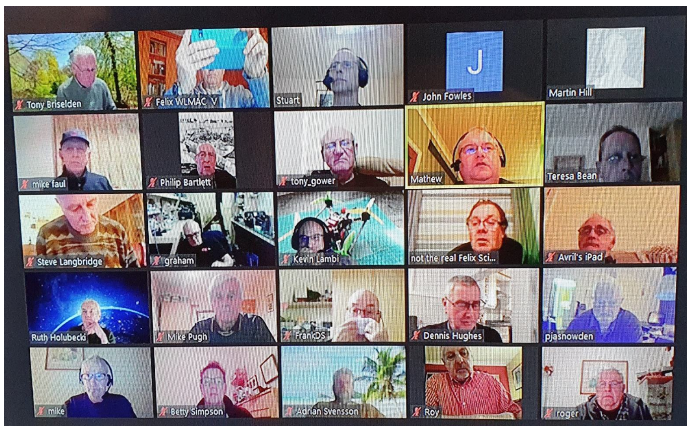
First Ever Zoom AGM meeting with 30+ members attending (couldn't capture all), Very successful but we all missed our Christmas meal.