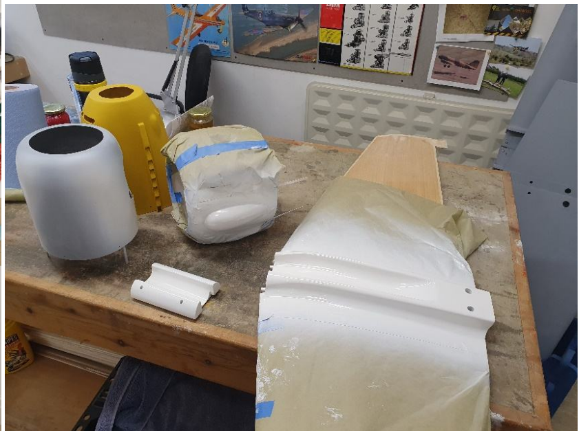
Tony B's Wing has been sprayed ready for covering the rest, fuel tank cover and damaged cowling repaired also for Tony B