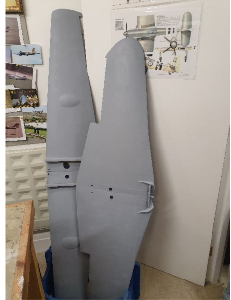
Wings and fuselages both in primer