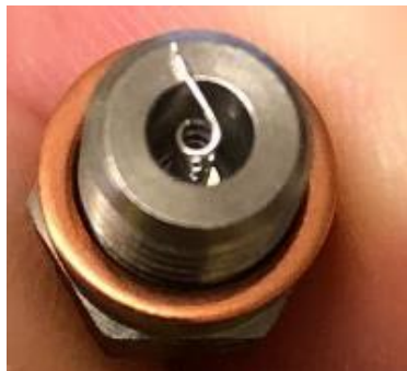
New shiny plug