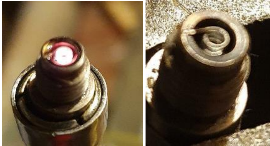
Appears to glow nicely but the element has a dull coating effecting performance