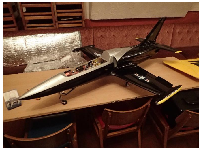
Club night 9 th Feb – Roger's topless model [Mat Dawson Photo & caption].