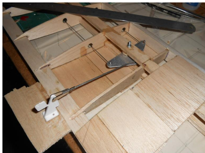
Detail of bell-crank installation during sheeting of the centre-section. Pushrod is shown here linked to a dummy flap horn to allow the correct line-up for the exit hole when the sheeting is completed.

Over the years, I have had many designs and articles published in modelling magazines, and wrote my regular “Flying Sparks” column in RCM&E for about 15 years. Clearing out some old papers recently, I came across an issue of Model Aircraft magazine for May 1964 containing my first published plan, for a 1 metre span control-liner, the “Knight Errant”. The original flew well with a