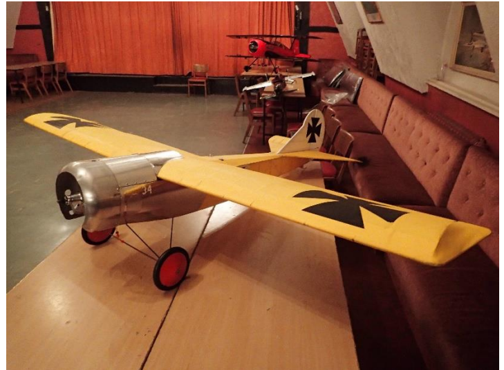
Club night 9 th Feb – Magnatilla with Laser Twin.