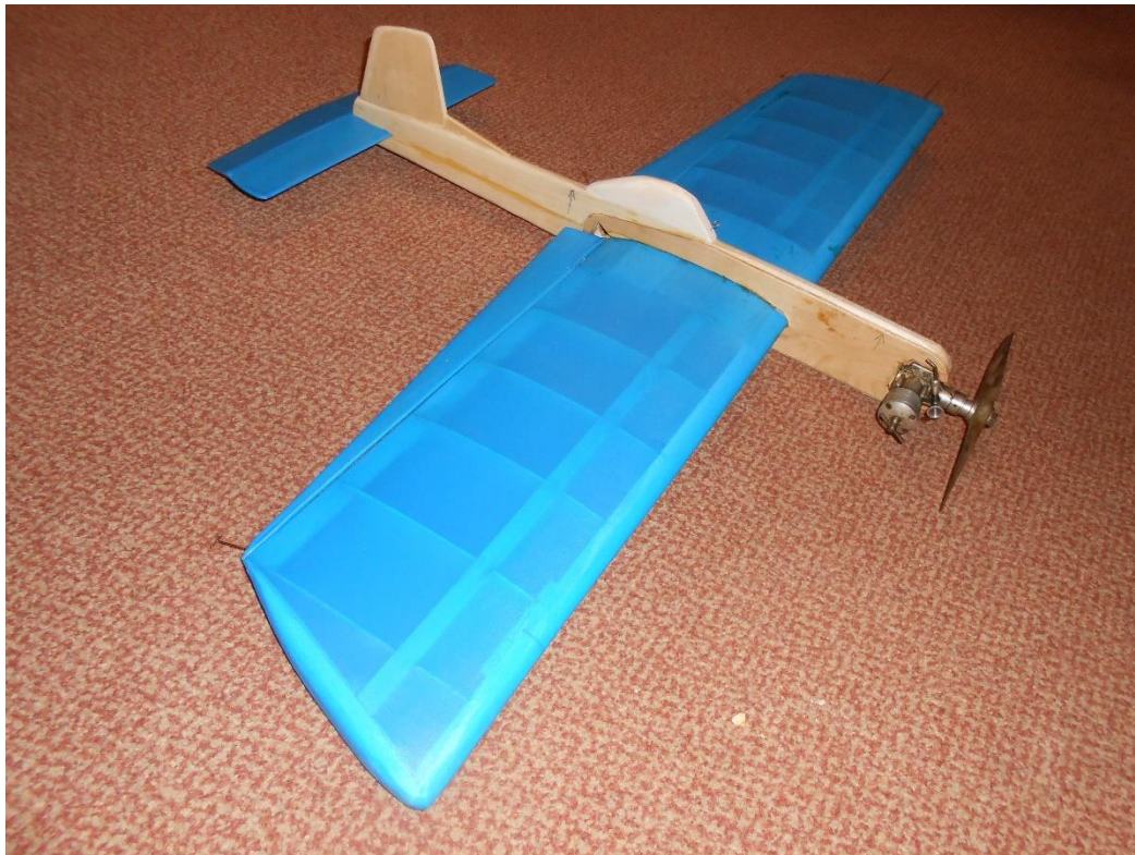
New Knight Errant model nearly complete with Solartex on horizontal surfaces [Dave Chinery Photo].

Over the years, I have had many designs and articles published in modelling magazines, and wrote my regular “Flying Sparks” column in RCM&E for about 15 years. Clearing out some old papers recently, I came across an issue of Model Aircraft magazine for May 1964 containing my first published plan, for a 1 metre span control-liner, the “Knight Errant”. The original flew well with a