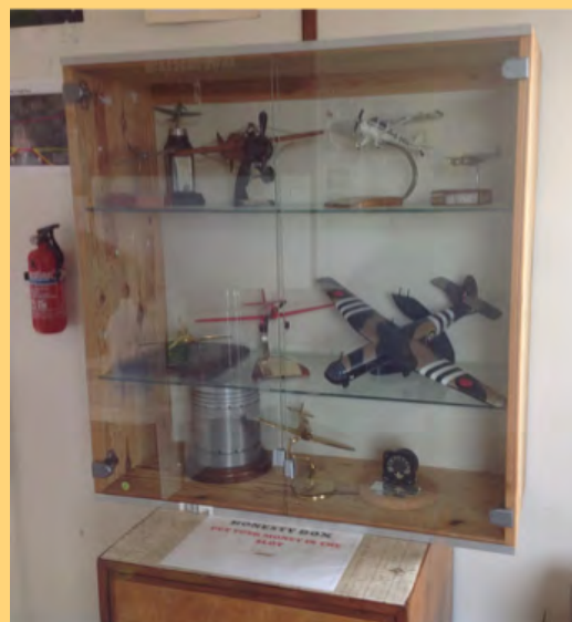
The new Display Cabinet and Award Board.

Many thanks to all those who turned up and helped in whatever role you played, many hands do make light work. Plus thanks to the Catering Team who bought all the food to ensure a good finish to the day.