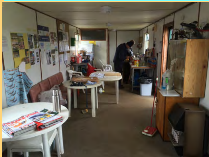
This is a 'before' shot of the hut on the day.