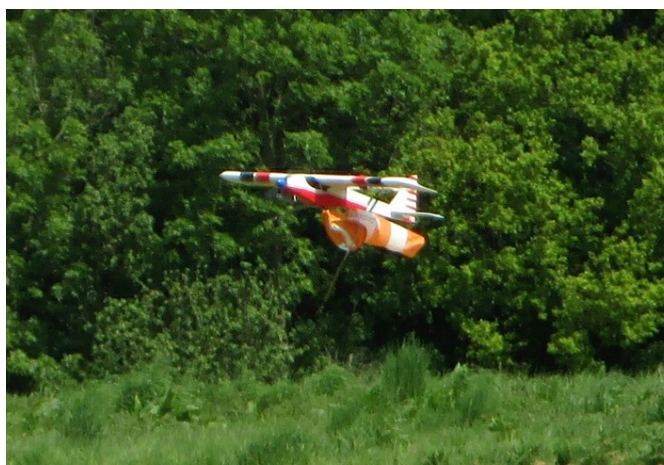
Des Jones decided to take the windsock with him on this flight. Both the windsock and the plane landed safely.

About 25 members turned up for the free food and drink.... Oh and to discuss the Astroturf. The sausages and burgers were great too.