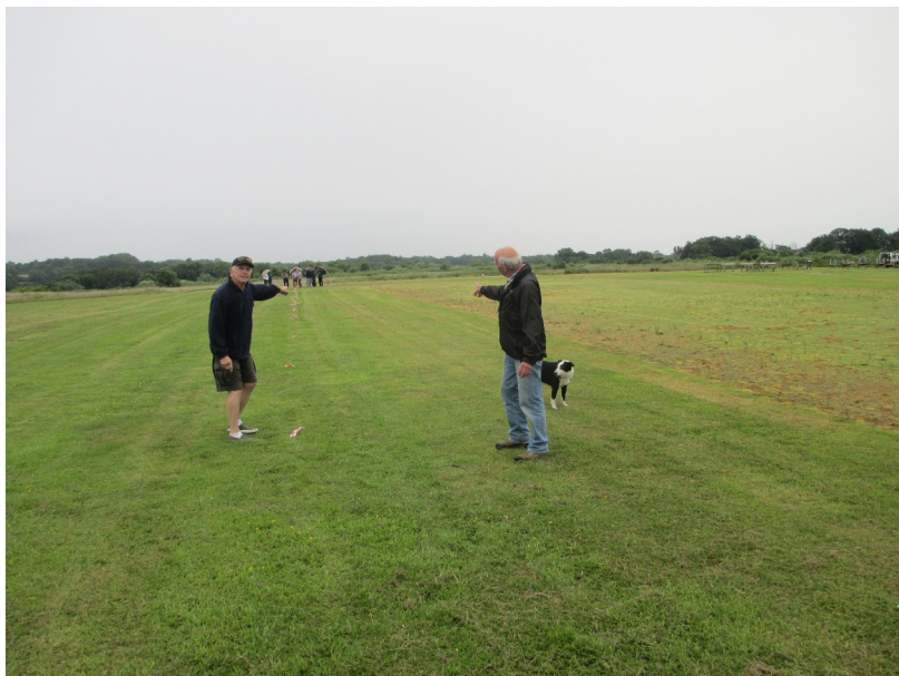
Some random pointing showing the agreed extension area. That's all clear then!