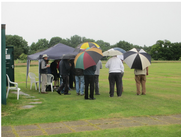
Above - members discussing the astroturf extension in the rain? No - its the crush to get at the BBQ.