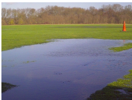
After the thaw in early February