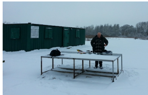
I know my hat is in here somewhere...