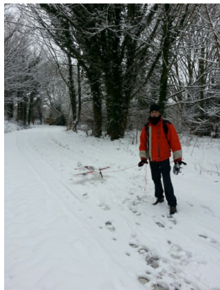
Taking the Acromaster for a walk...