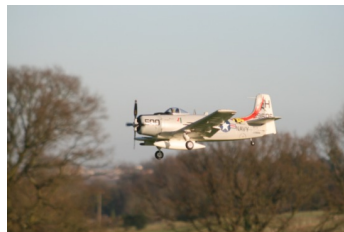
Skyraider on Finals