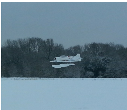
Acromaster with waterfloats for skis on finals