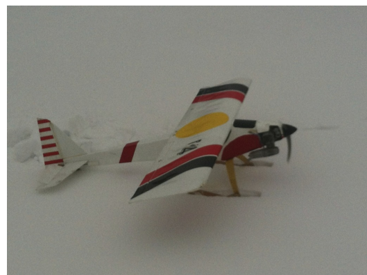
Ready for takeoff