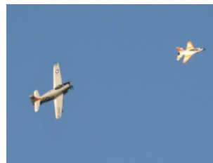
Skyraider chasing F16 snapped by Charlie