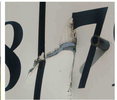
Above: Local mental deficientes having a summer evening drinking party at Harefield could not resist damaging our new peg board while they were at it. A reminder to us always to make sure to lock up the clubhouse.