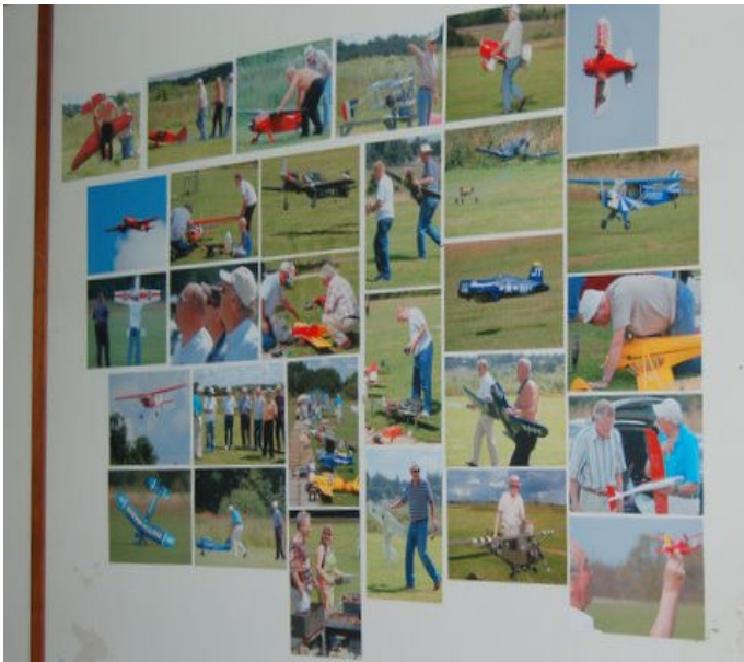
A new gallery of photographs taken at the 2007 Scale Day, has gone on display in the club house. Members sheltering from the cold during the coming winter may glance at them to remind themselves of a warm sunny day at Harefield, back in the summer!