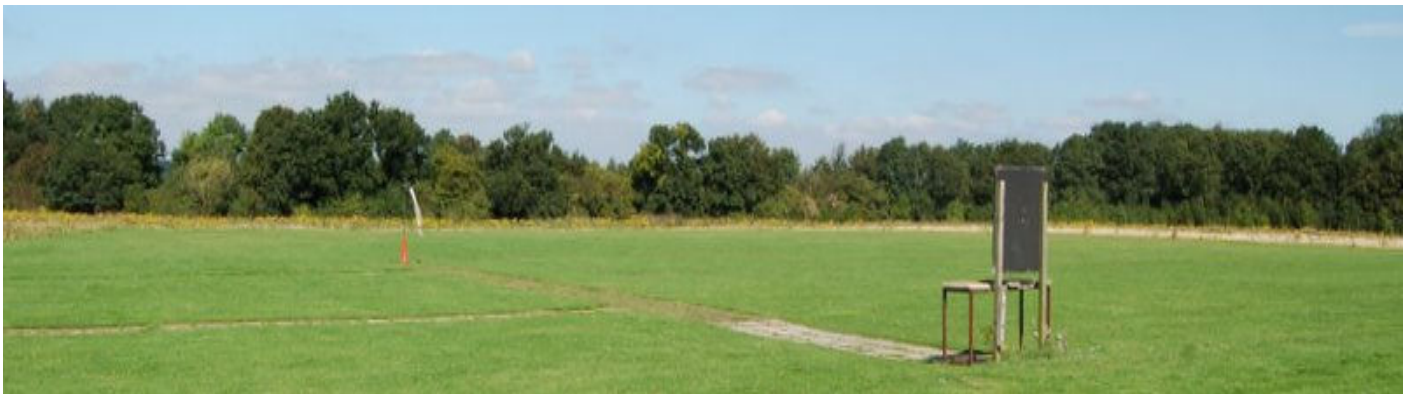
Noon at Harefield on Saturday, August 25th - the bank holiday weekend. After more than a week of low cloud, wind, rain and cold, WLMAC members flock to the field to enjoy a perfect flying day of windless sunshine!