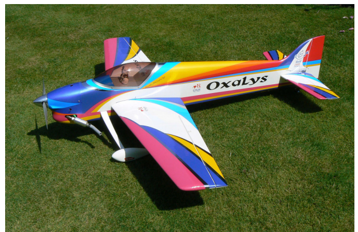
Tony Taylor's Oxalys pattern ship after its maiden flight.