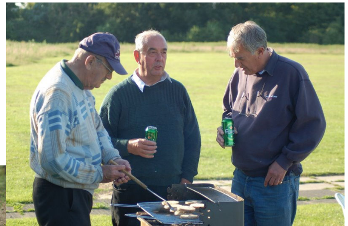
"Thoughtful stalwarts gather round the barbeque"

After two years of really super field meetings, that Wednesday field meeting and barbeque in June, postponed for a week due to foul weather, was held the day before our longest day - in a chilly, howling wind. Only a few stalwarts turned up to eat, drink, and watch people trying to fly.