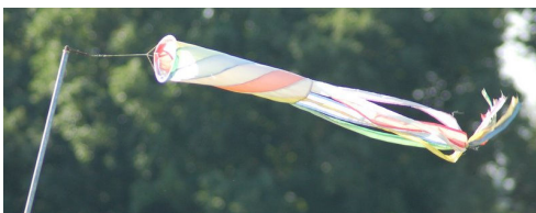
"In this kind of wind"