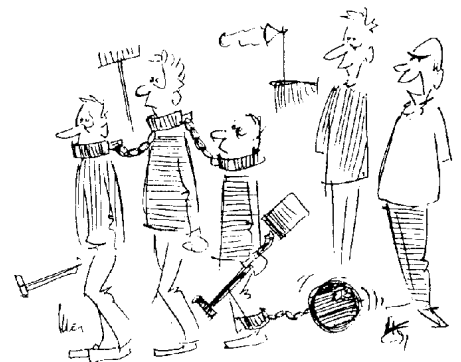
The committee just love a work party

forecasts for the local area, so try out www.metcheck.com and see what you think. We'll add it the WLMAC website shortly. Work on preparations for our big day has progressed well and on Saturday morning there will be a work party to fill the rabbit holes. If you can contribute to that vital exercise, please bring a gardening trowel.