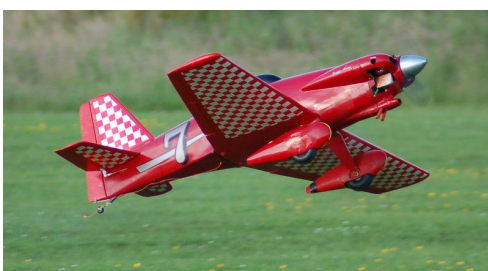
"It's one thing to get off the ground"