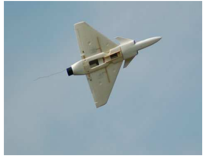
Saab Viggen Fly past