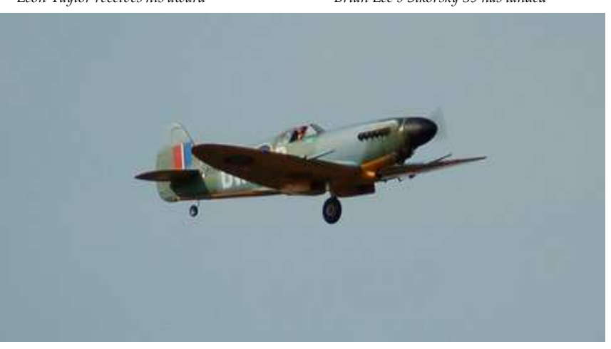
Gary\ Skerton's\ Spit fire\ caught\ with\ one\ under carriage\ leg\ down