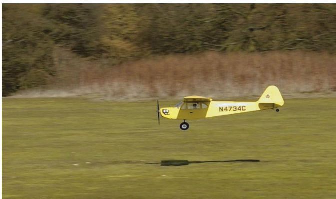
Chairman's Cub landing on the repaired strip

extensive rain. This view from the pits shows the extent of the work and the impact this has had out to the east. The committee thanks everybody concerned for their support.