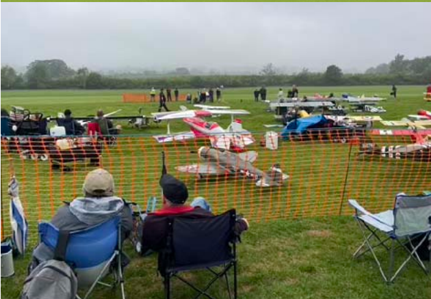
The LMA Show

In summary, the LMA was more the flying show that we were interested in. The sight of three huge Wellingtons lumbering around in formation was a sight to see. I never took a camera as the weather forecast was so poor so no decent photo's I'm afraid.