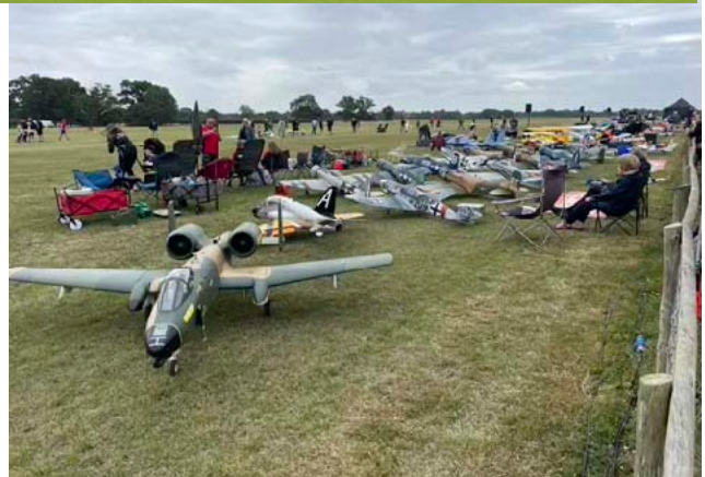
The Southern Model Show

There was a new trade stand in attendance too.