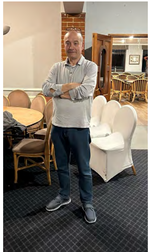
Your Doorman for the night.