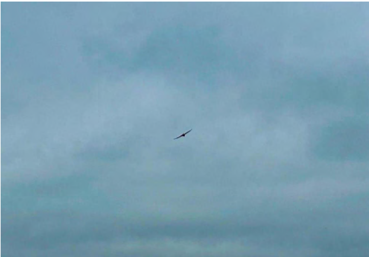
A bit of aerobatics from a Red Kite. At no time was it bothered by our activities.