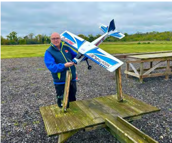
I don't only fly helicopters and do like the new WLMAC clothing.