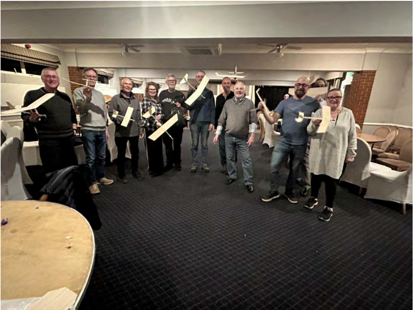
I give you the competitors.