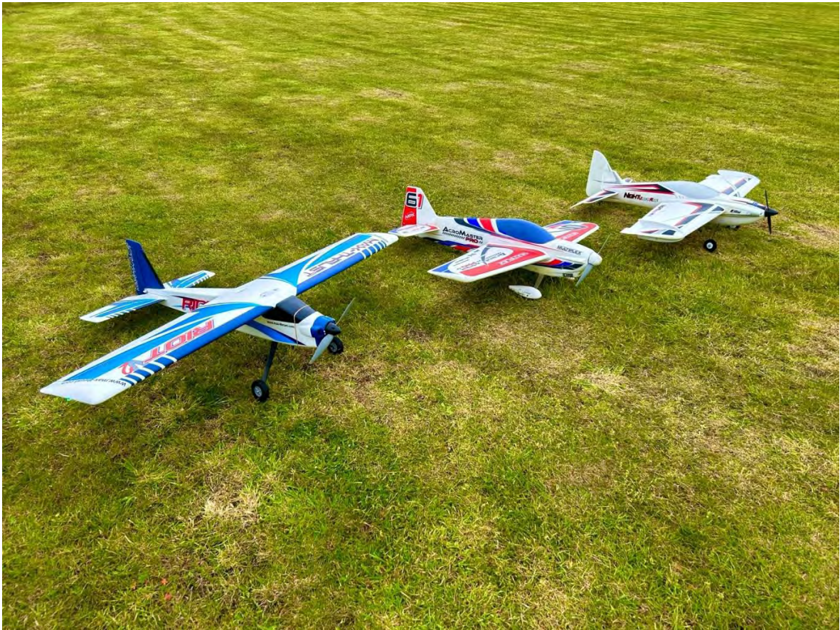
We flew this selection of aircraft to show small wheels do work there.