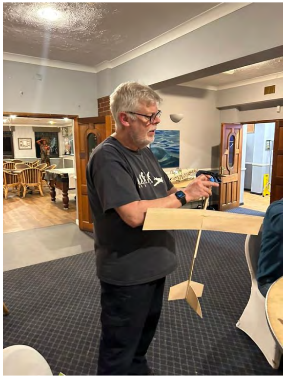
Last minute fettling.