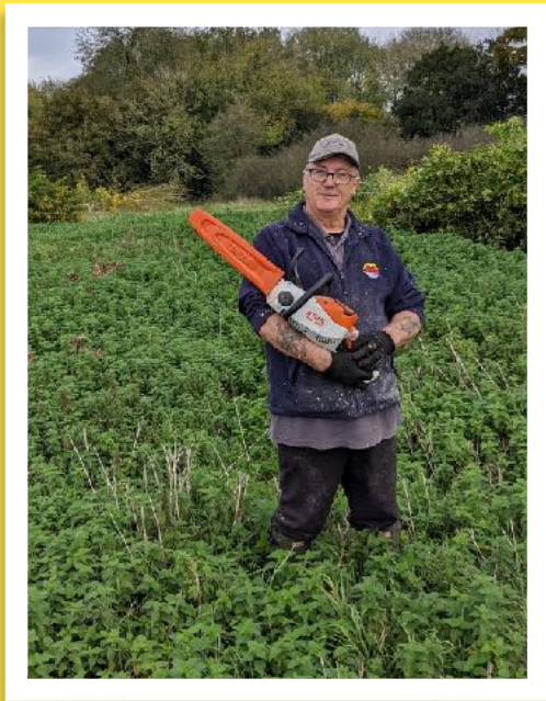
Here's a couple of the intrepid Lumberjacks in action.