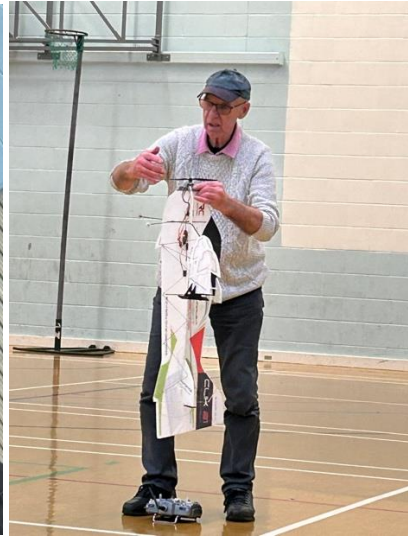
Derick it's not IC.