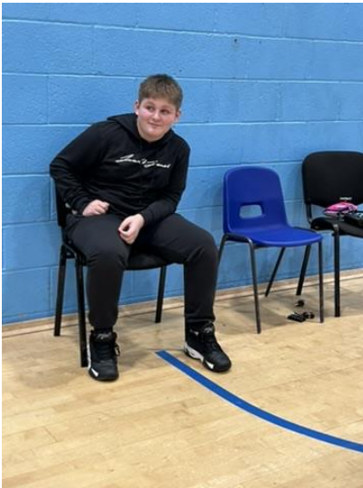
Samson Wants a Helicopter.