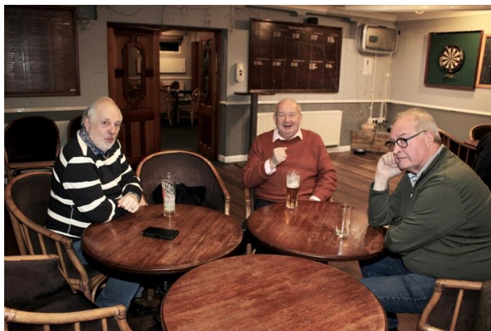
A waiter service would be good.