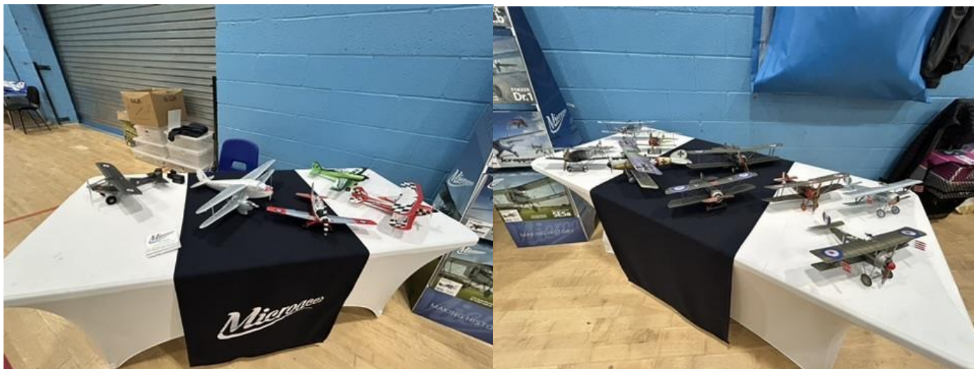
Micro Aces Display.