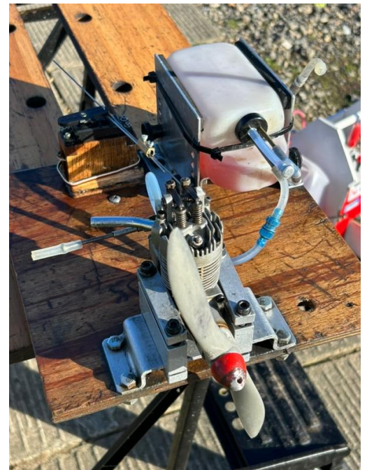
Four-stroke on the test bench