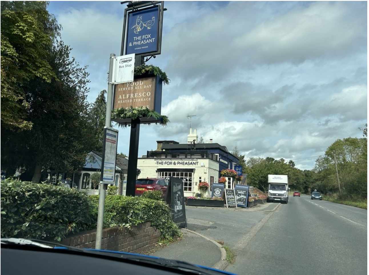
The Fox & Pheasant, Pickering's fantastic local pub/ eatery.