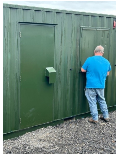
New main door fitted with extra lock protection.