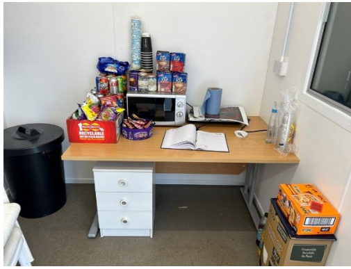
Tuck shop replenished.