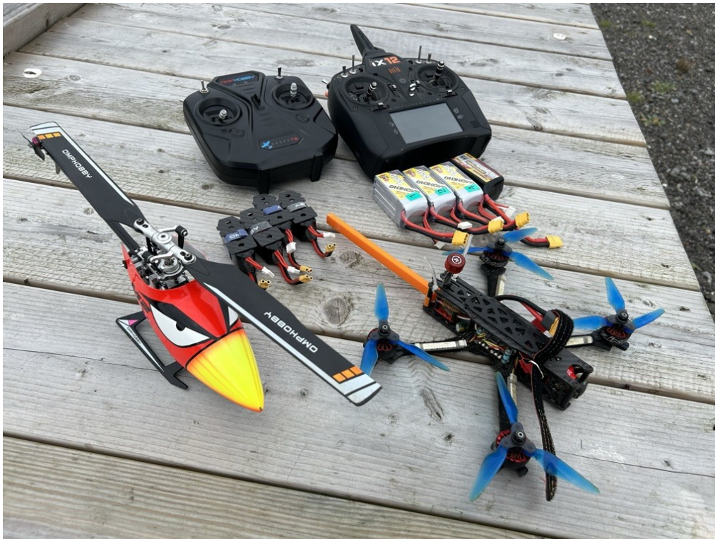
A few rotary flights for me on Saturday 30 th .