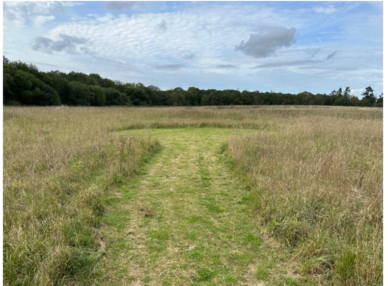
A nice walk to the Rotary Area.