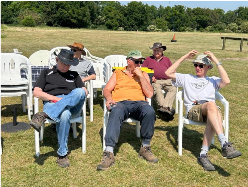
Let's have a break and get ready for soup.