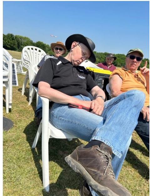
And a quick cat nap.