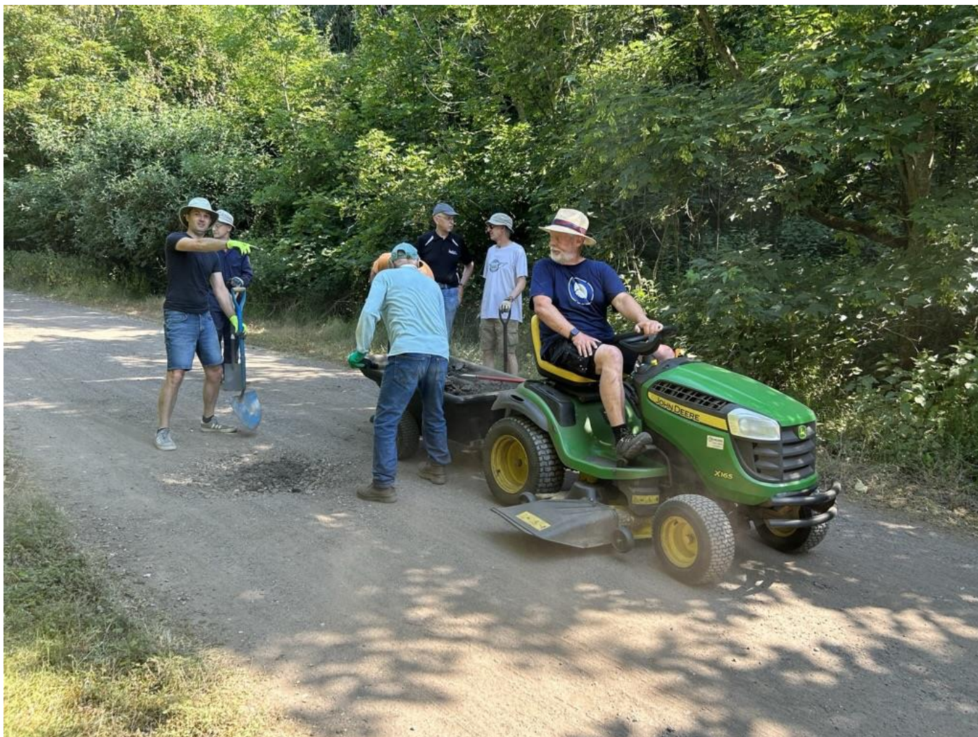
Work-party on the entrance road at Harefield.

Funday is soon – Sunday 9 th July. We have decided we will not be having a work-party the day before, as such a good job was carried out recently but we will therefore need to do all the other preparations 1 st thing on Sunday, so please get there early to help set up etc.