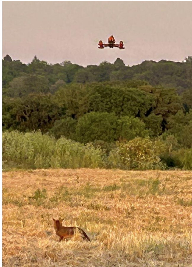
Our very own Fox wanting to play with a Drone. Not fazed by it at all!