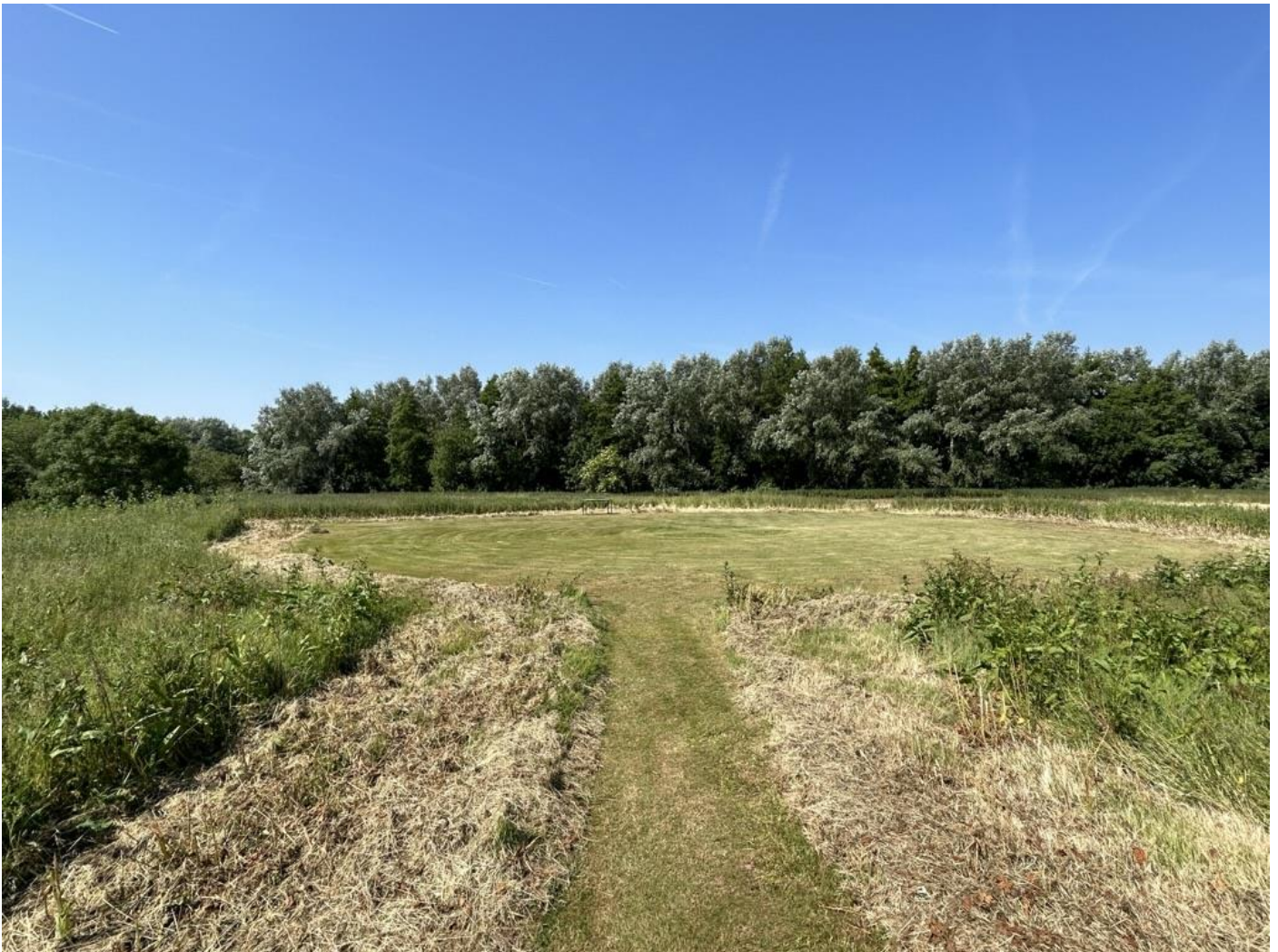
Helicopter/Quad patch looking good.