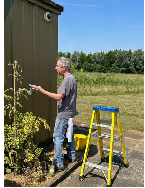
Washing the Plants.