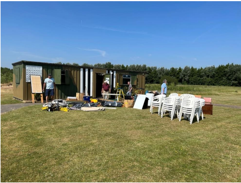
Emptying the club house.