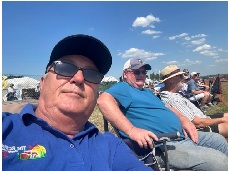
Lapping up the sunshine.