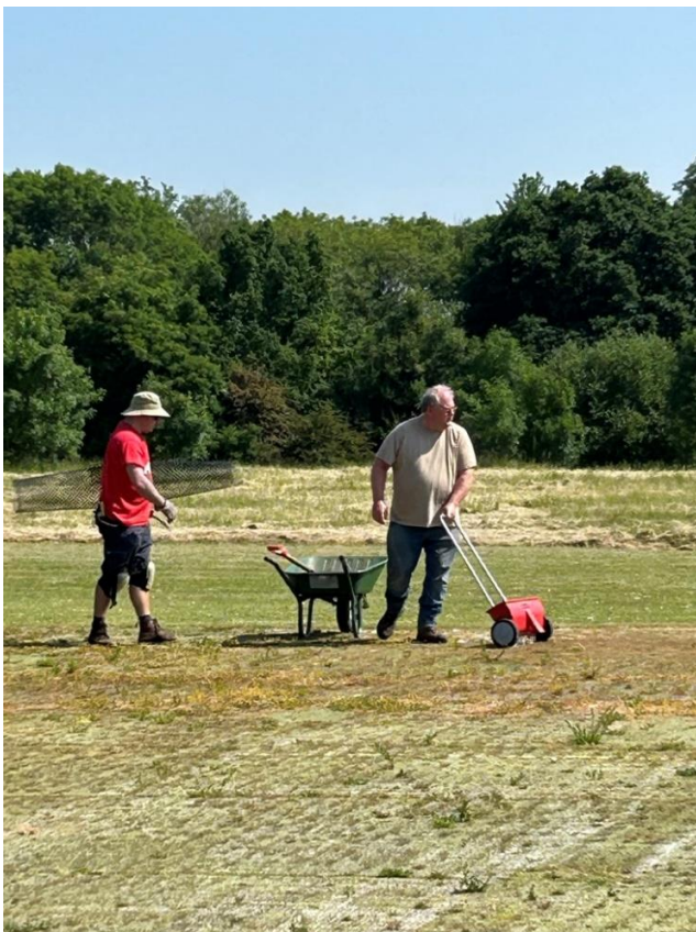
Washing powder distribution.