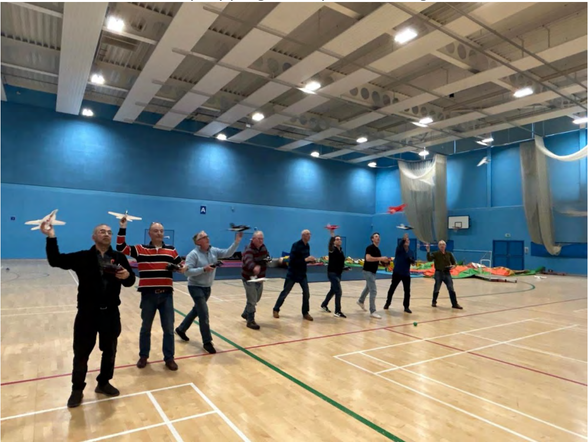
Mass launch of Streff Jets.