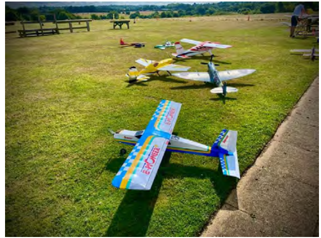
A nice selection of planes waiting for a slot to go flying.