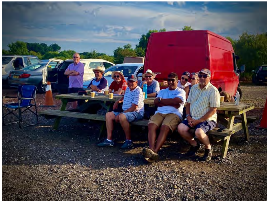
Don't think we can eat any more food.