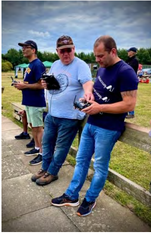
Pilot training on the Buddy Box.