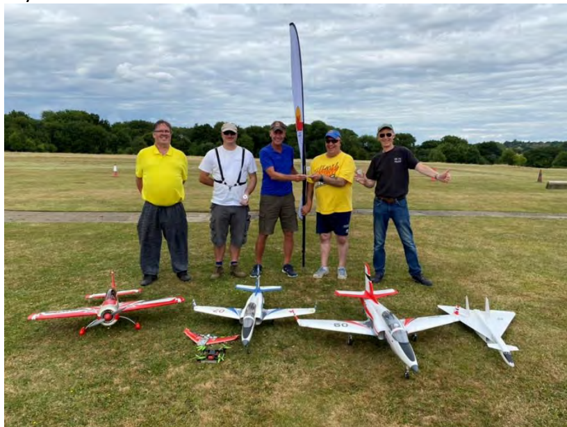
And our prize winners again.