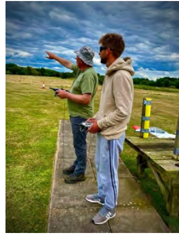
I live over there.