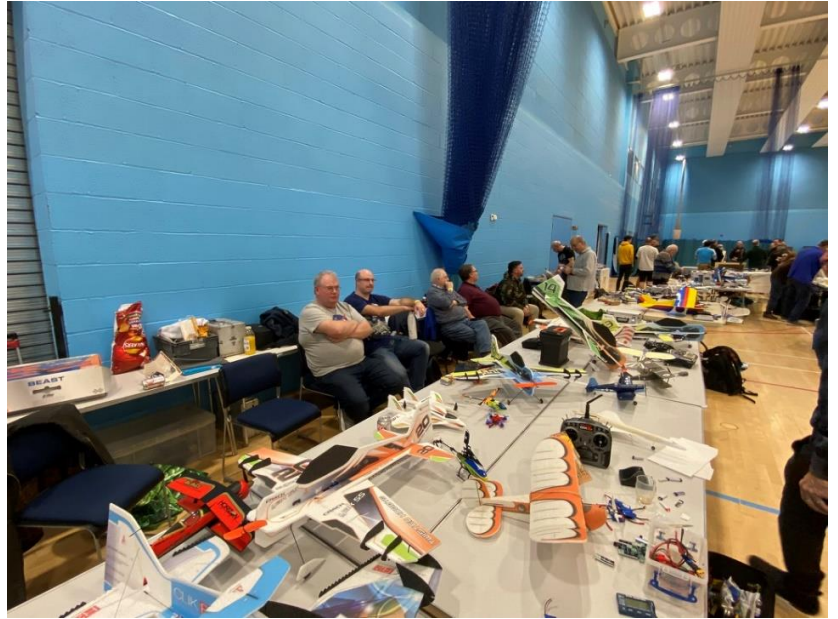
The "proper" flyers waiting for a free-flight slot to finish.