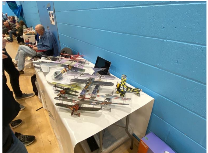
More Microaces aircraft on display.