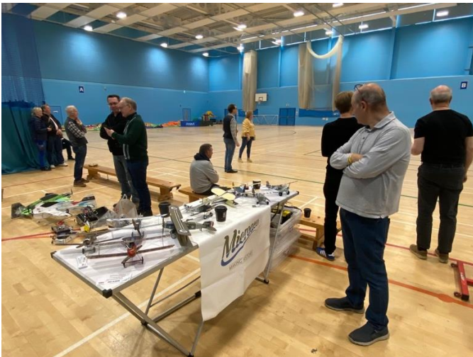
Microaces display stand.