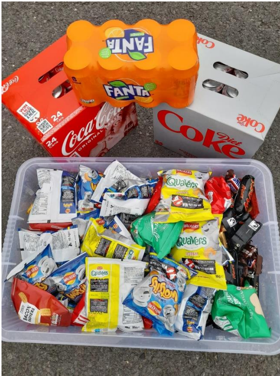
Feeling peckish, look no further than our hut

Tuckshop in the hut - has been re-stocked with goodies – 50p/ item (put the money in the honesty box). Also, there is a good supply of Cup A Soups (these are free).