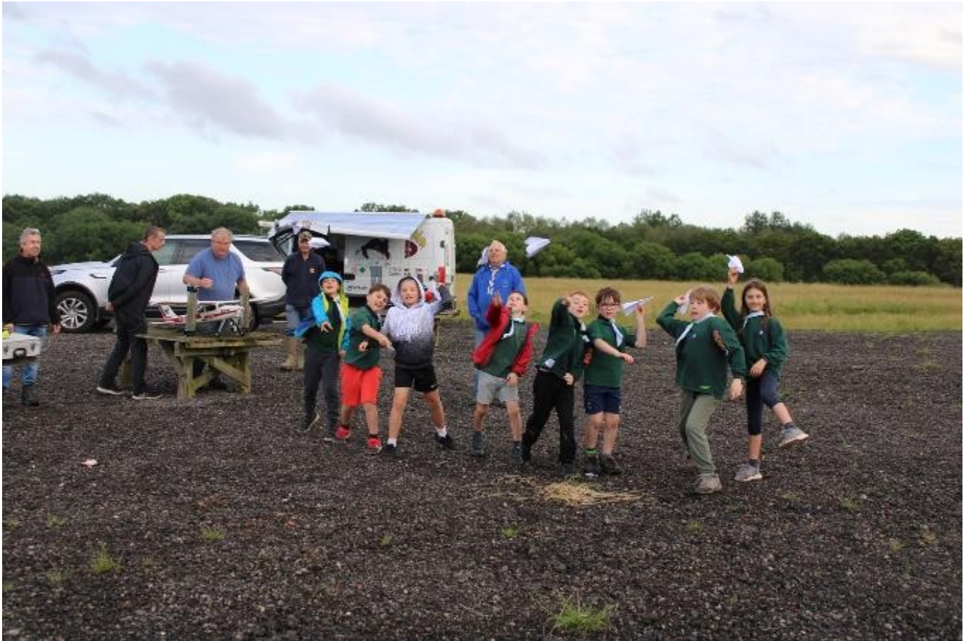
1 st Stoke Poges (Air Scouts) Cub Pack at Pickeridge Farm.

Welcome to our August Newsletter – It's nice to see many of the activities starting to return to our club, after such a long period, due to the Covid lockdown. We had another BBQ at the field and the car racing is starting to attract more competitors. Cars of all shapes and sizes have been spotted on the main strip and also back on the car track. It's good to see social distancing still in practice.