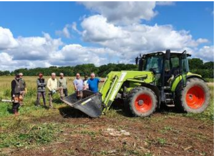
Party hard at work