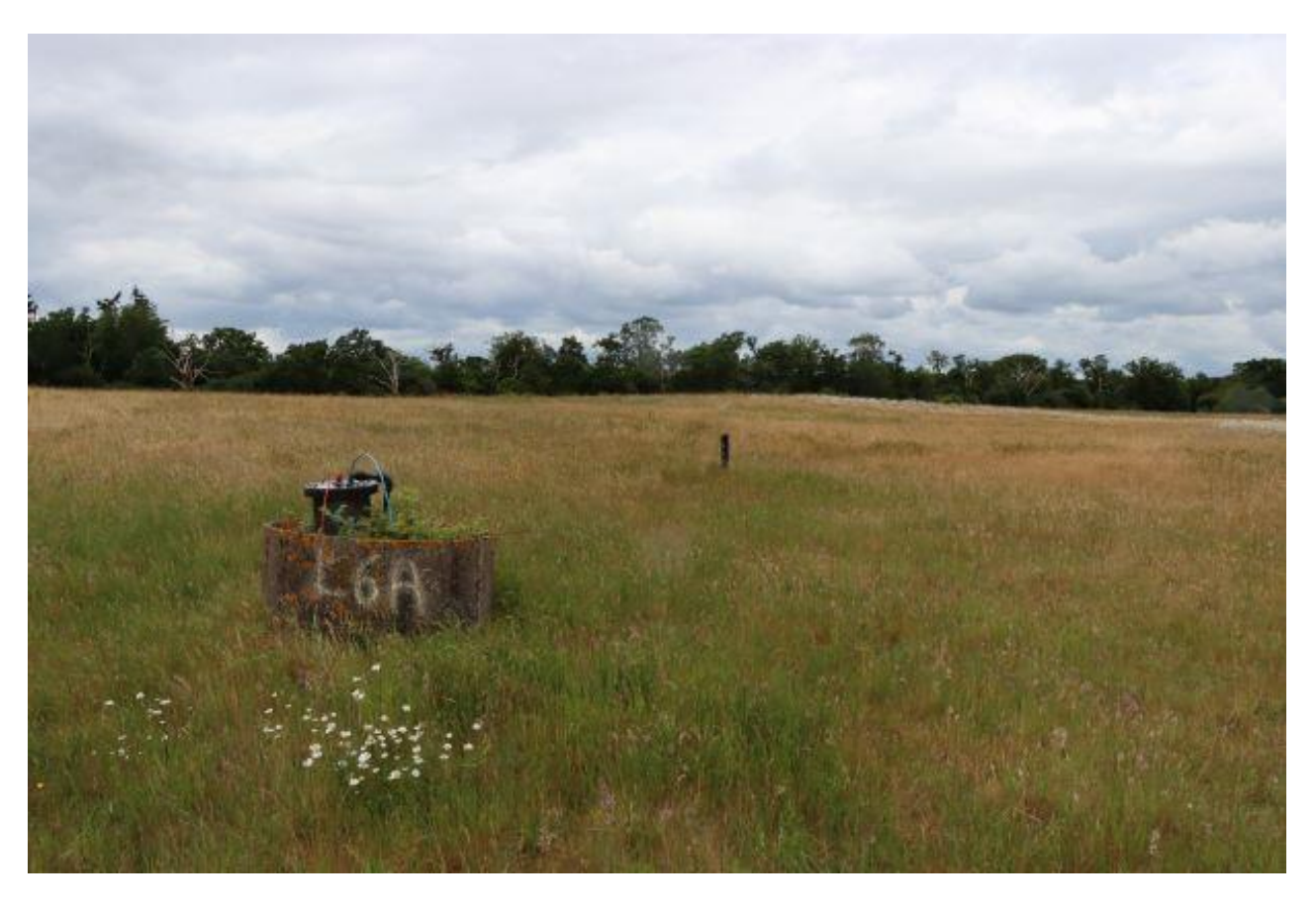
Suez have offered to lower some gas monitoring points to ground level, placing manhole covers over them.