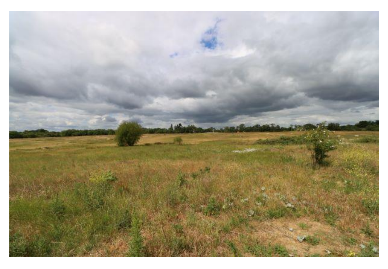
Ground view of the field