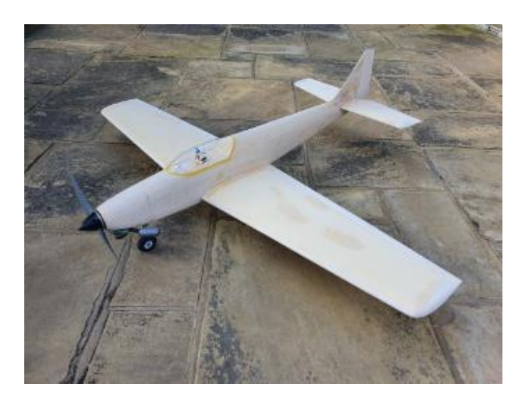
Ready for some covering.