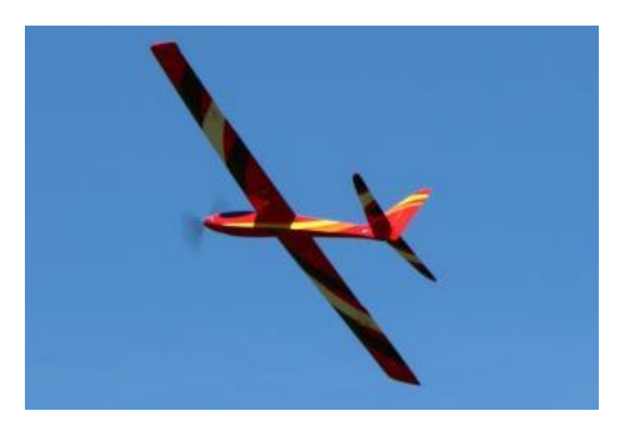
Colin's Phase 6 glider returns to the skies!