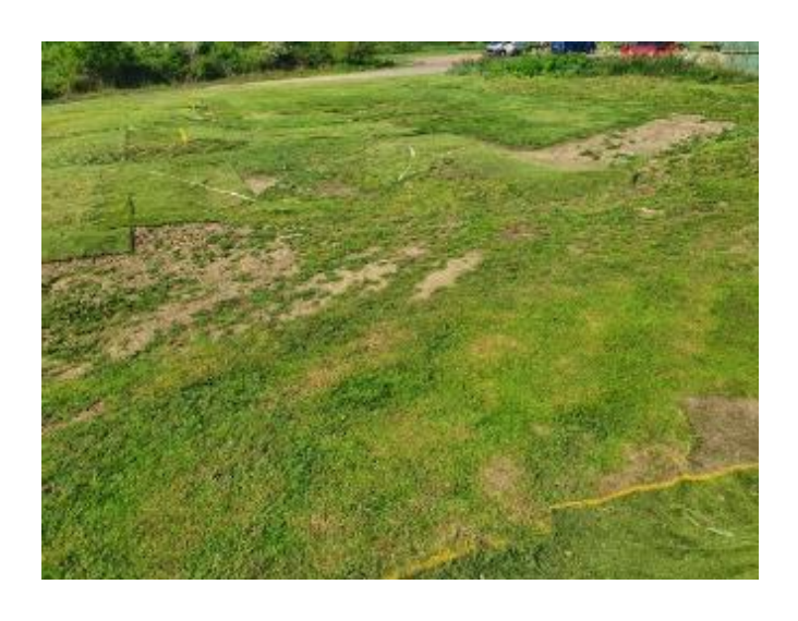
The grass has managed to grow on the car track