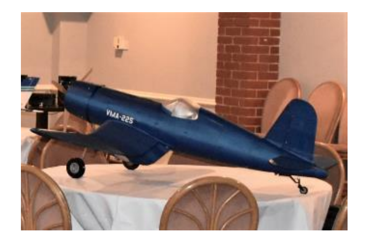
Felix's 3d Labs printed Corsair