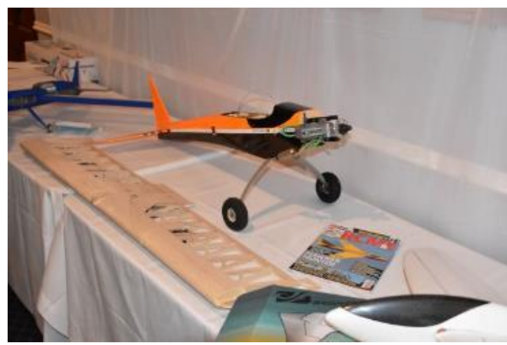
Graham Motler's Wot 4 re-build