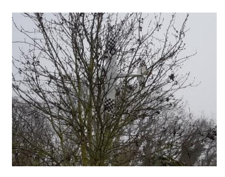
Colin's Wot 4 foamy, stuck up a small tree with no damage

February club night and projects evening- A good turnout of members came early and enjoyed a meal at the restaurant it was followed by a display of our winter projects. We had some very good models.