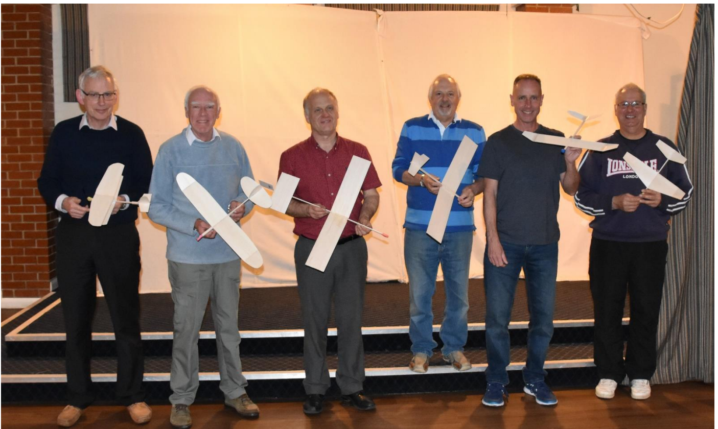
Well done all.