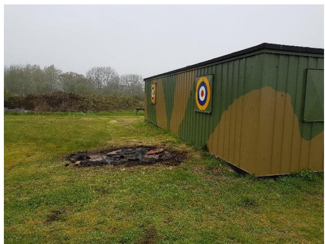
Damage close to the hut, fortunately very little damage to our hut.