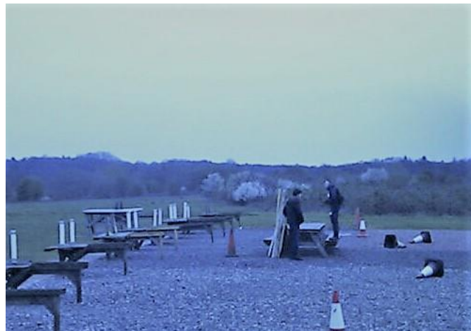
The culprits, not very clear images, but they have been passed on to the police.