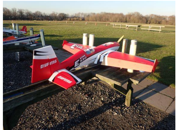
Tony P FMS Foamy Extra, superb finish