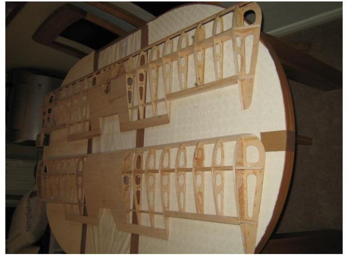
Puppeteer 11 wings