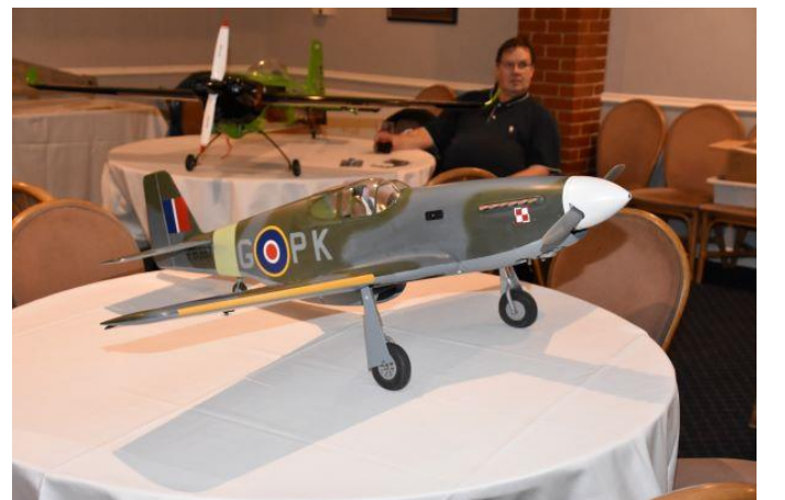
Mat's Flightline Spitfire