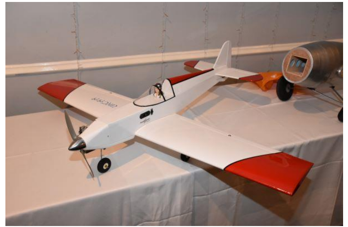
My Gangster 52 built from old templates