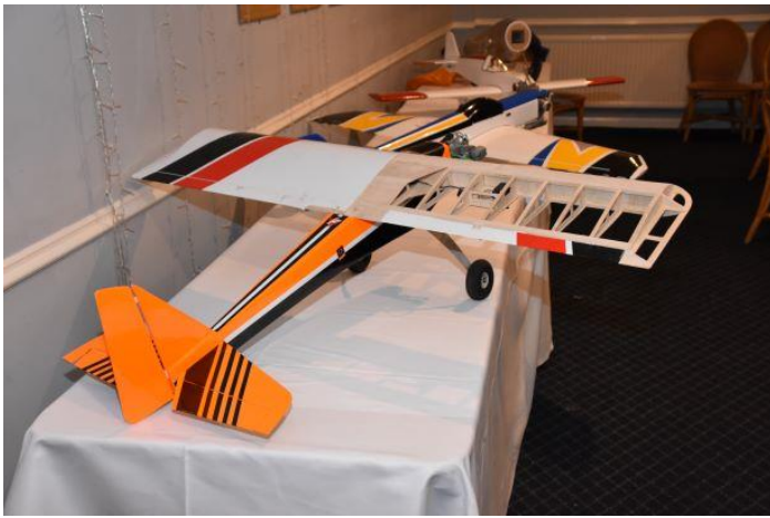
Graham Motley's re-furbished Wot 4