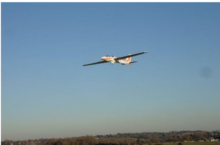
Tony P's FMS Fox maiden flight