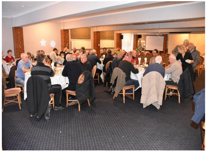
A fantastic turn out for our joint Christmas meal and AGM, £10 was paid for each member's meal by WLMAC. 34 people attended the Christmas meal and approximately 50 attended the AGM. A great evening was had by all.