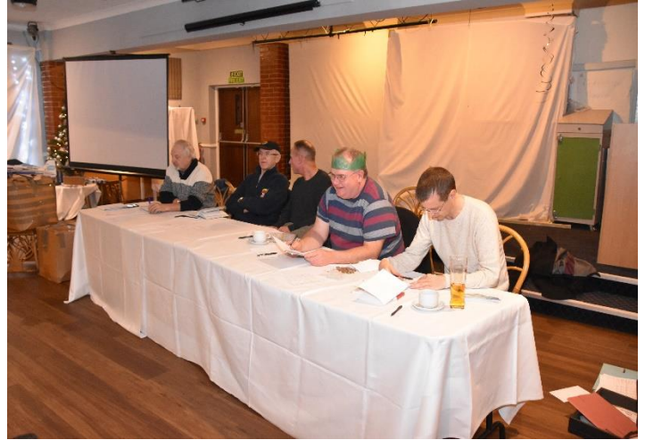
The King checks his notes before the meeting commences.