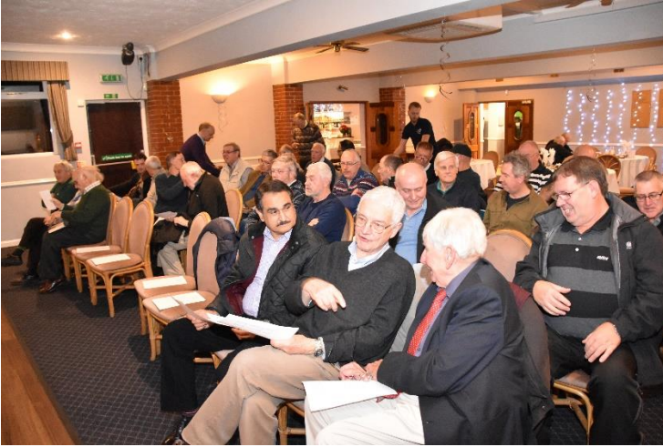
Just a few steps from the dining table and all ready for our AGM.