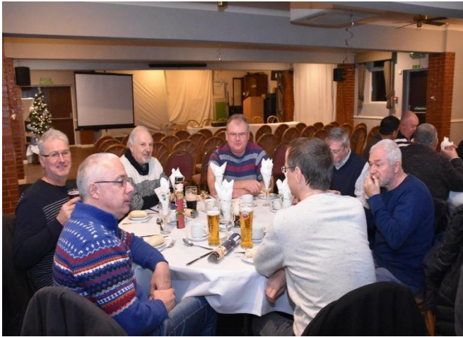
The committee patiently waiting for their Christmas meal.