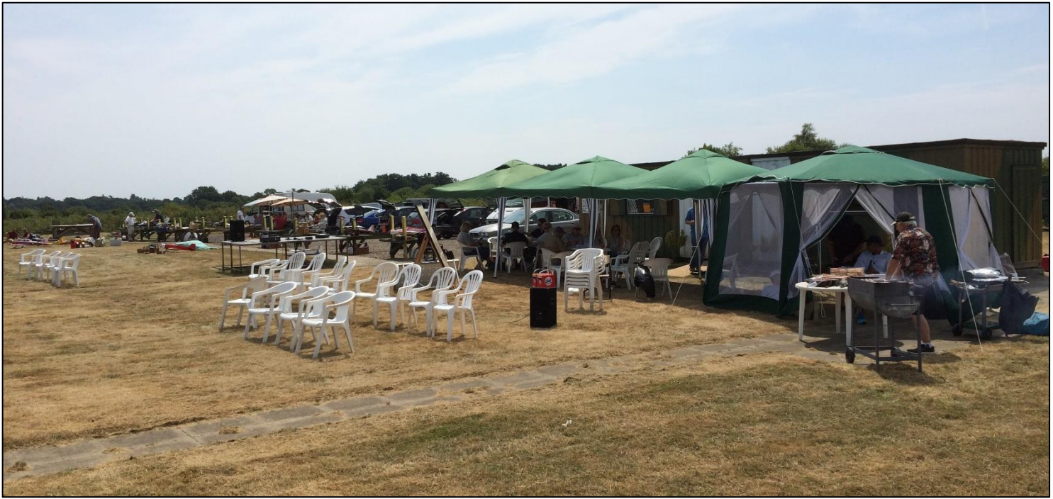
The flight line at about 12:00; I was only hanging around near the BBQ because I thought the burgers might be ready...

I spent most of the time flying and taking pictures so it's difficult to give a blow-by-blow account of what happened, or who did what to whom. This year the report is therefore going to be in two parts with not a lot of text;