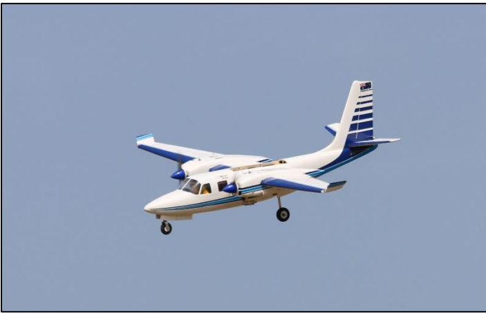
Colin Martin's Black Horse Shrike Commander with top hatch missing. Spans 80 inches, weighs about 10 lb and has two Saito 56 four strokes.