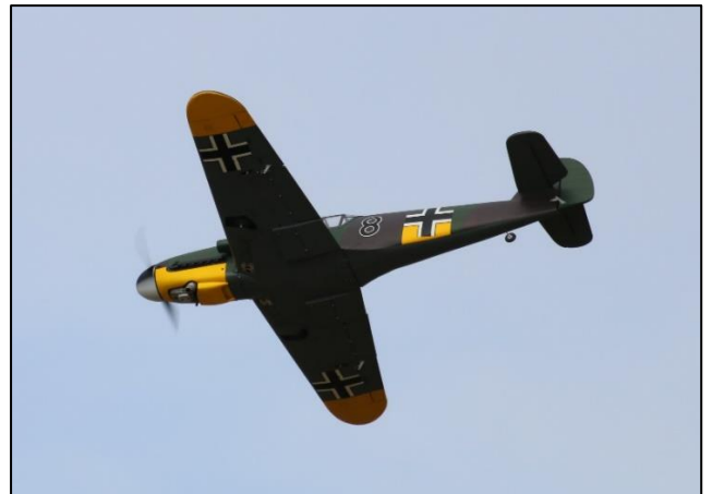
Andy Blackburn's Hangar 9 Messerschmitt bf109F, flies convincingly on a Laser 120