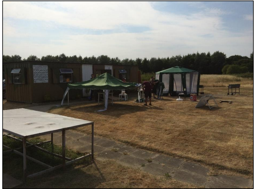
Packing up at about 5 pm; didn't take long.