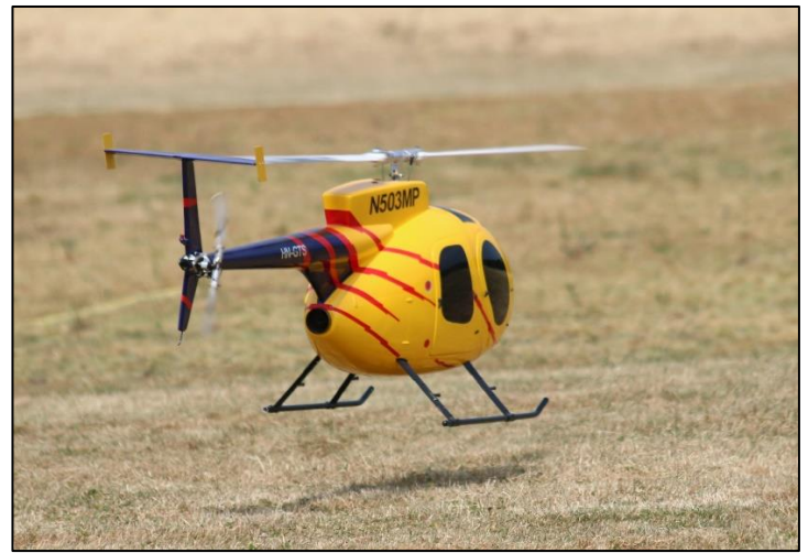
Tony Parrott's flybarless T-REX 700 dressed up as a Hughes 500. Runs on 12s LiPos.