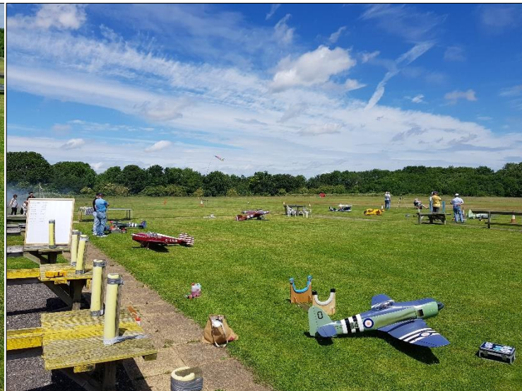
The competition in progress, note the BBQ smoke in the background – looks a bit windy. But apparently, a good time was had by all.