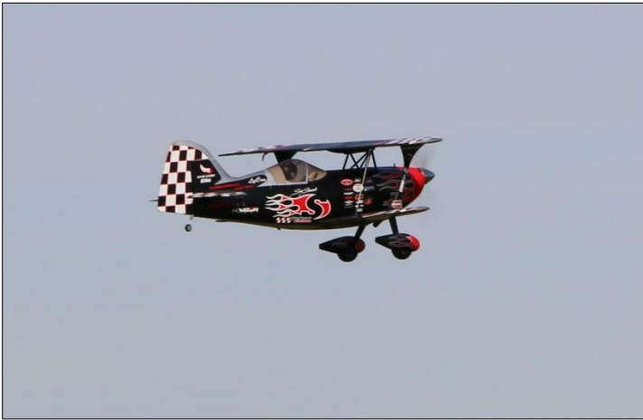
Felix Scicluna's EFlite Prometheus runs on a 6s5000 LiPo, gets about 10 minutes flight time. Flies well.