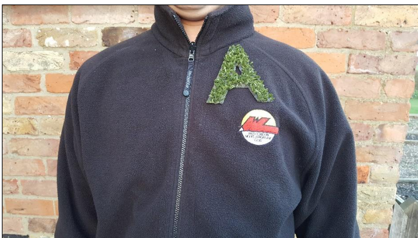
The WLMAC "A"chievement

What you will need to do to achieve the award is to demonstrate your ability to land reliably on the Astro-turf; the examiner will need to see a minimum of 5 successful landings on the Astro-turf out of 3 declared attempts, without running on or landing short. Slight bouncing will be acceptable but your model will - of course - need to stay the right way up; you can't land and then tip it on its nose to avoid going into the long grass, in other words.