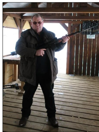
Now look what you've done - someone has upset the Chairman...

We had booked a shooting experience and were taken to a gun club on the outskirts of Kiev. There, an English speaking instructor took us through shooting a 9mm handgun, an AK 47, a pump action shotgun, a Dragonov sniper rifle [Ooooh! Ed] and finally a side by side shotgun. All this was booked beforehand but we took the opportunity to pay for extra ammunition and all had another go with the AK 47 and pump action shotgun firing solid slugs.