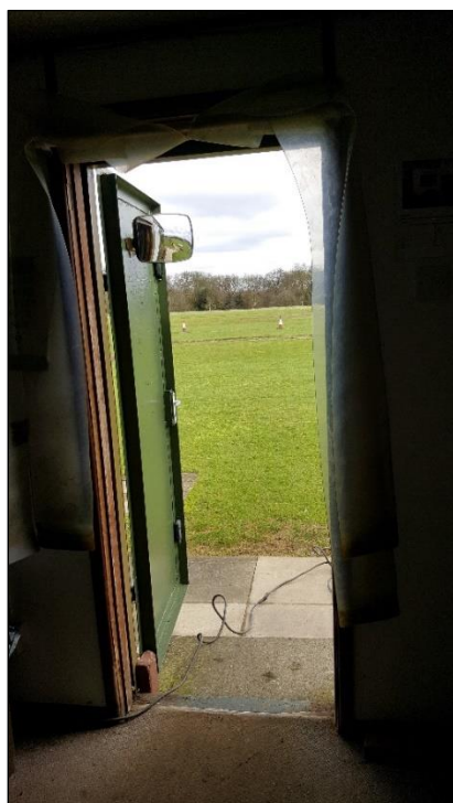
We've also got a new wing mirror; presumably, this is so that you can see when someone is sneaking up to steal your sandwiches...