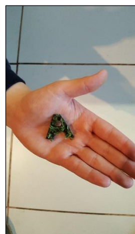
"A"S3X - It makes no difference!

We will be arranging a series of test sessions, and if successful you will receive a badge that can be displayed on your flying attire or flight-box. AS3X and other gyro users will also be catered for, although the award will be granted to their receiver and will therefore be a smaller version. Please email the chairman to register your interest, he can then contact the appropriate people to make sure you get tested as soon as possible.