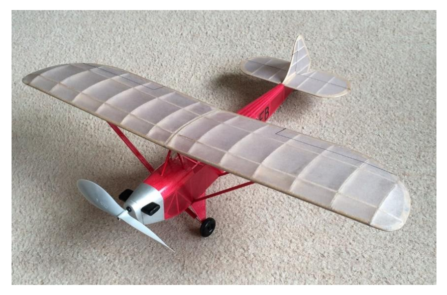
Aerographics Luton Minor