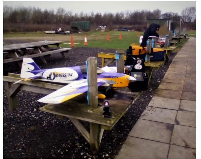
The Pits on 14th January... wait a minute, is that rain on the camera lens?