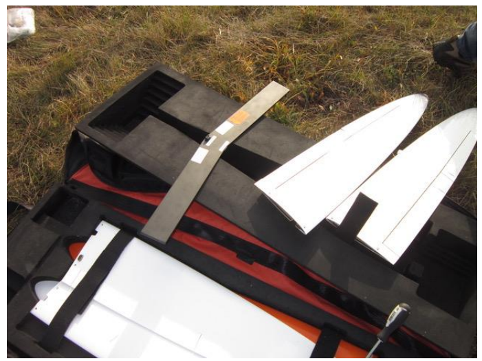
Here we have the flight battery (the boomerang shape) which fits into the wing, the connection is made when you bolt the wings onto the fuselage. The plane is a standard powered glider, weight has been stripped to lengthen the flight times.

So far, the plane has not liked the cold and the real duration has been cut from 2 hours to 30 minutes. The battery is a 4c 8900 mAh LiPo and fits inside the wing which is clever, this leaves the body free for the cameras. We go out, programme the plane to look at areas where we believe stuff to be hidden and then launch it. We fly it around 200-250 m high as