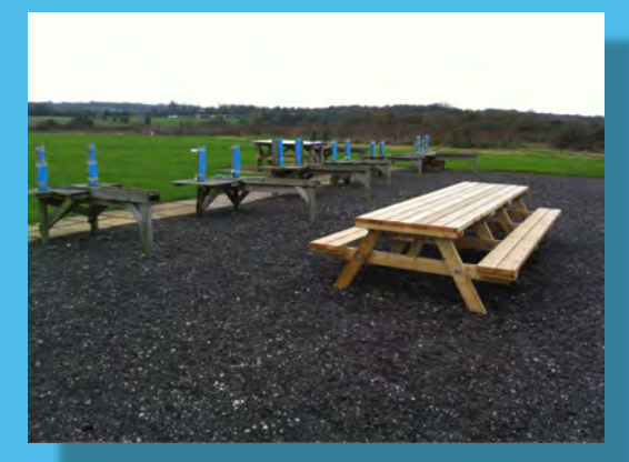
A New Bench