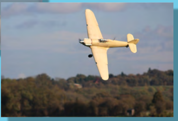
The approach went well until the overly sensitive ailerons caused a few problems.

Here is the Hurricane on its final approach.