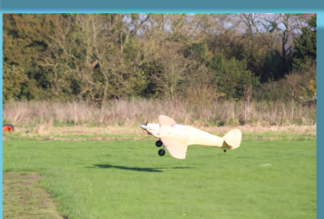
Flying skills helped and the plane looked to be safely down at this point.