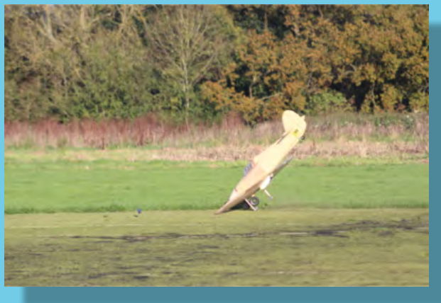
However, the arrival was rather hard and ripped both tyres off their hubs.