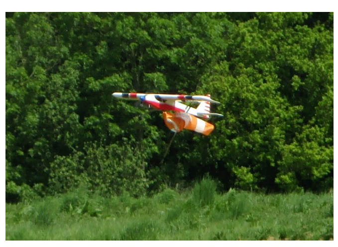
Des Jones decided to take the windsock with him on this flight. Both the windsock and the plane landed safely.

About 25 members turned up for the free food and drink.... Oh and to discuss the Astroturf. The sausages and burgers were great too.