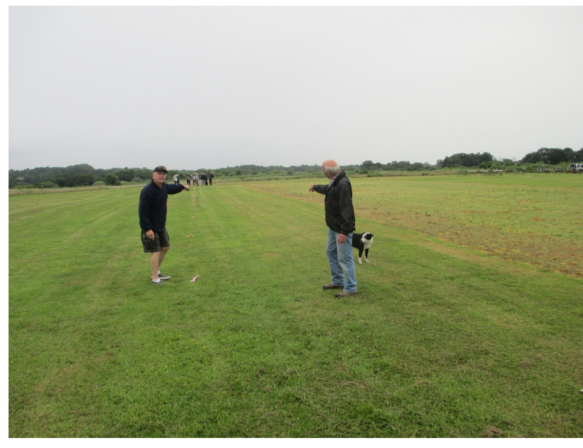
Some random pointing showing the agreed extension area. That's all clear then!

Below - some random wandering about in the rain while Buffy wonders if she can get to the last of the food