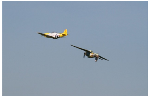
Formation practice is continuing but Tony needs to learn to fly the right way up!