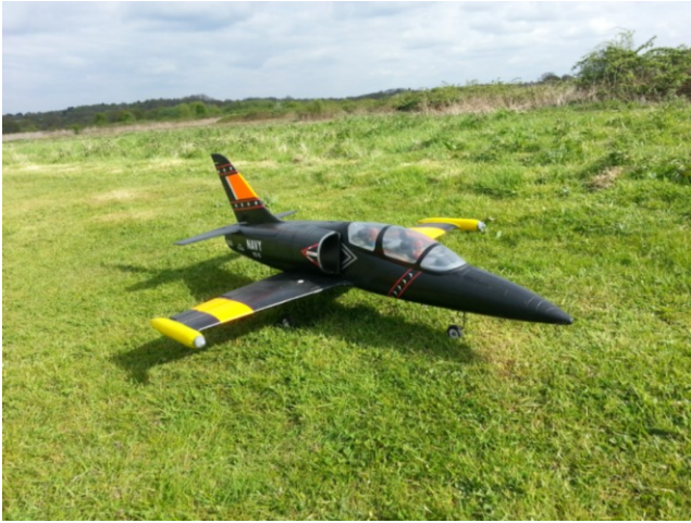
Bill's Graupner L39 Albatross EDF Jet