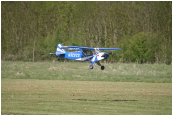
Len's Cub about to touch down

Temperatures were around 20 degrees with light winds and a few clouds which provided a perfect backdrop for some formation flying and other warbird adventures.