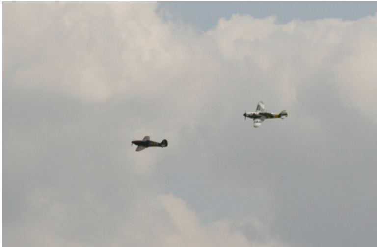
Summer 1940 over Harefield