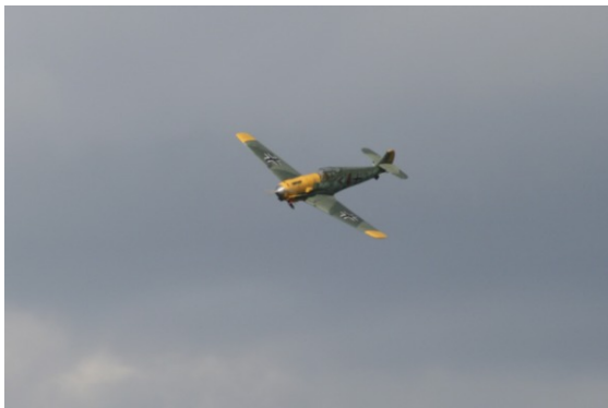
BF 109 looking for targets of opportunity