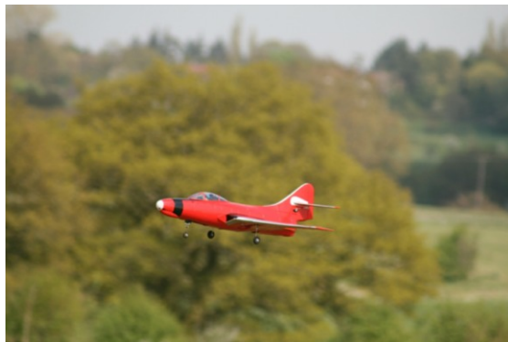
Simon's Cougar on landing approach

Bank Holiday Monday on the 6 th May was a rare perfect flying day.