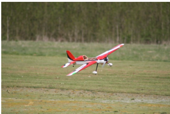
Simon's Yak 54 - the pilot could take no more and bailed out.

Thanks to Des, the grass around the strip was in excellent condition so run offs or landings that did not quite make the strip were not a problem.