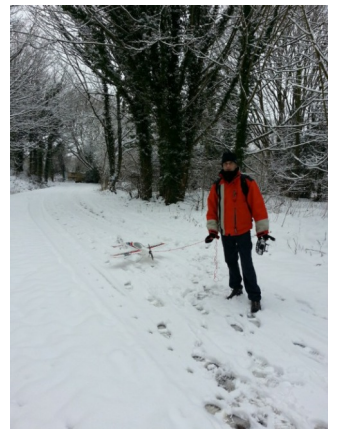
Taking the Acromaster for a walk ....