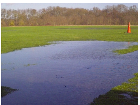
After the thaw in early February

Do you have a building project, modelling tips or pictures that you would like to share with other members?