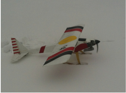
Ready for takeoff