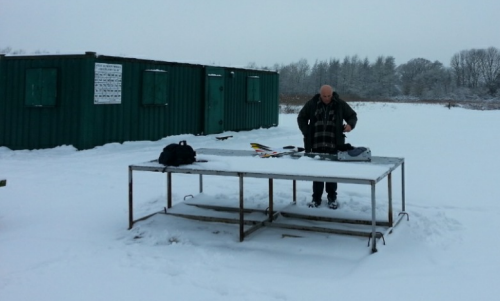
I know my hat is in here somewhere ...