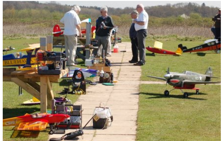
Above:- Just to keep hopes for a summer alive, this was the false spring that came to us for a few days in April.