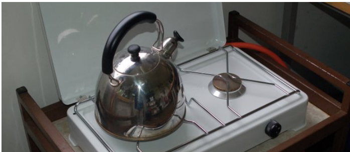
Our smelly old club house gas oven and hob has been replaced with this snazzy Italian gas hob. Its big gas rings are highly efficient, and members are asked NOT to leave the flame burning unattended under the kettle. It uses up gas unnecessarily. See notice on the wall.