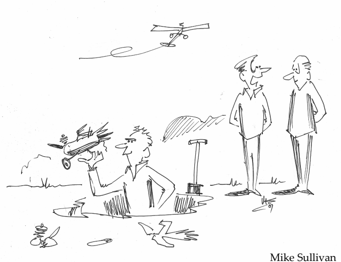
We call it aeromodelling archaeology. After 21 years of flying at Harefield there's a wealth of history under that grass!

There will be a barbeque at the field on Wednesday 9<sup>th</sup> May at 6.30pm and a demonstration of the latest electric flight technology by the people from FlightPower. They will be talking about the EVO25 which is the next generation of Lithium Polymer battery packs for RC flight that are bringing us ever more power and greater duration in almost-silent flight.