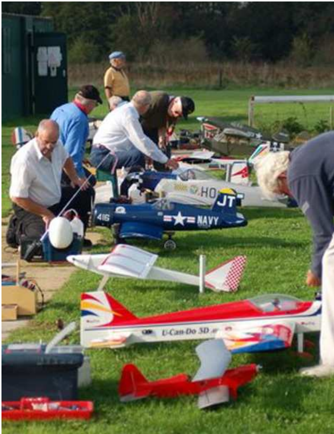
Before the wind and rain set in – a nice turnout on one of the sunny, windless days at Harefield. But it was Friday the thirteenth and there were several destructive crashes brought about by a variety of causes.