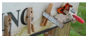
An end to our collection of tatty, poorly marked pegs