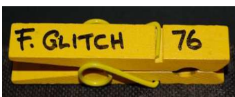
Mark your peg clearly with the permanent marker