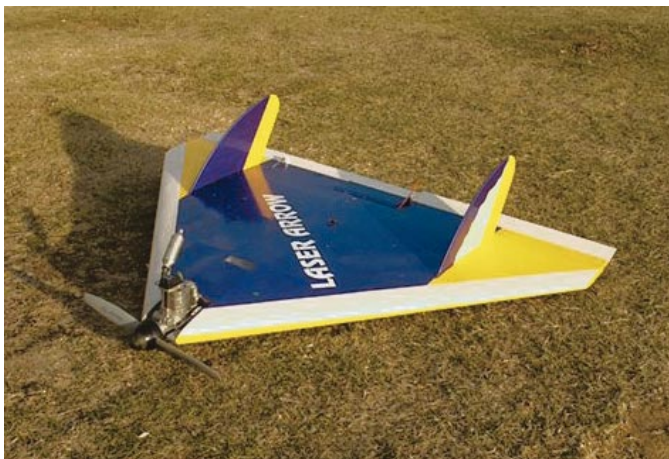
This model is for sale and will be at the bring and buy