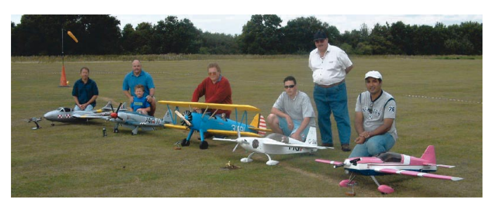
A recap of last year's result

Field arrangement and flying rules. Flying boundaries will be devised and marked out with tape on the day, with special regard for the safety of visitors. This