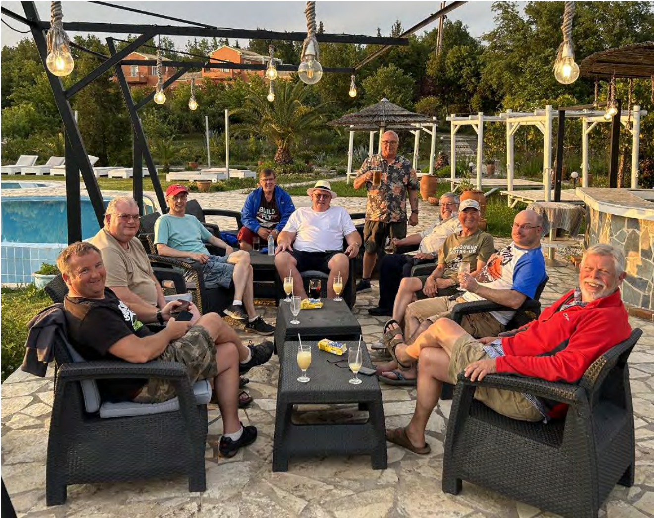
The Corfu Boys 2023.

Harefield Site. All in fine fettle. NB we will soon be having a work party – Saturday 10 th June (weather permitting). Please make the effort to turn up and help out, as many hands make light work etc. The main activities we need to carry out are as the list below, if you can bring tools great, if not, don't worry we have some available. There is something for everyone whether your able bodied or not and all attending will be provided with the usual lunch. Topping of the outfield will take place in the next week or so.