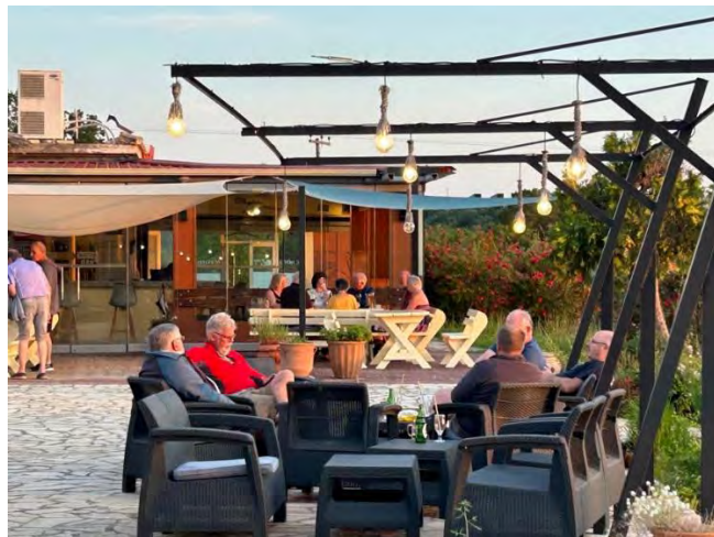
Nice time to chill.