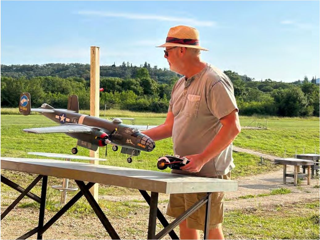
Well, that's different!