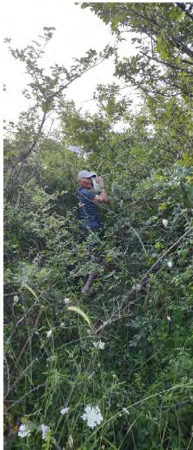
and another one!