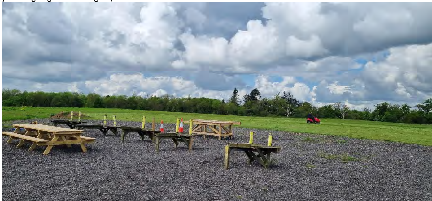
Pickeridge pits and runway - looking more and more awesome.

The entrance gate into the actual field has now got a combination lock on it and it is the same code as Harefield. If you intend going there to fly then please put a message on the Pickeridge WhatsApp Members page, so others know you are going etc. Also log any attendance in the book in the club hut.