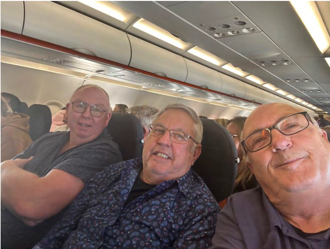
On the Plane