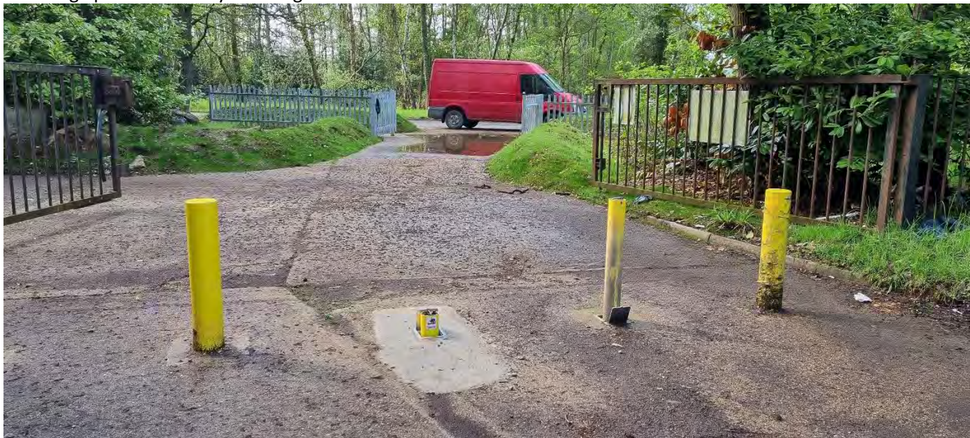
Ground water pushes up the gas assisted bollard.