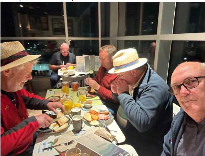
Early morning Breakfast.