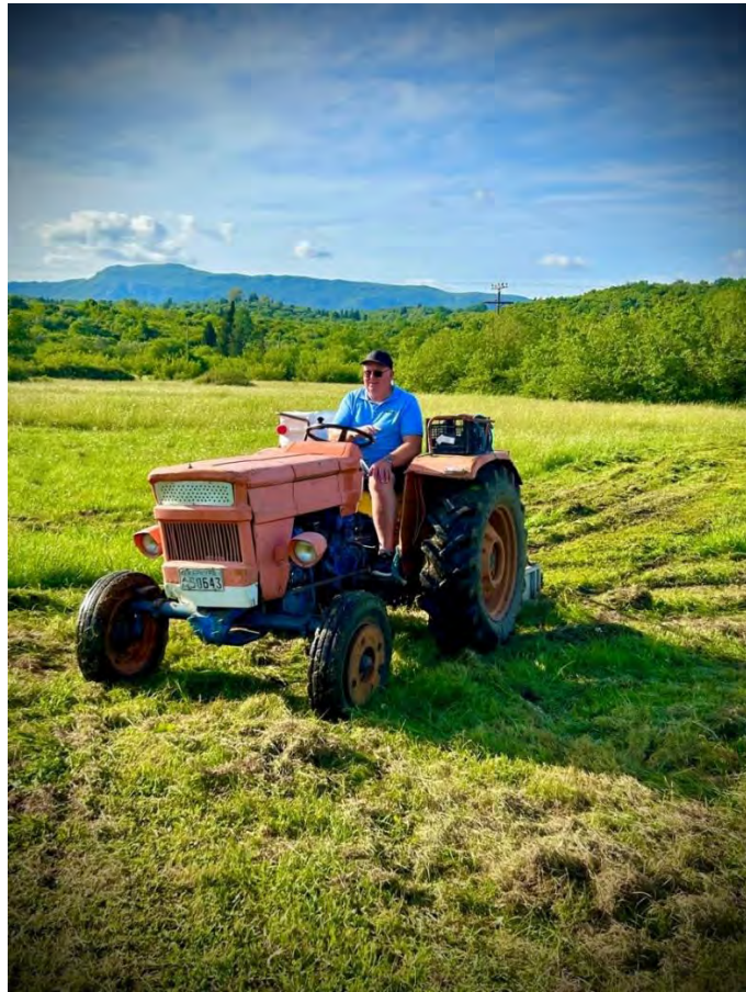
Roger that's not a plane or a left-hand circuit.