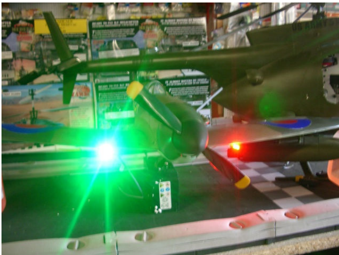
The Brentford RC's Christmas Bazaar was very popular with many of their LED light systems sold. Club members took the opportunity to stock up on other modelling gear.