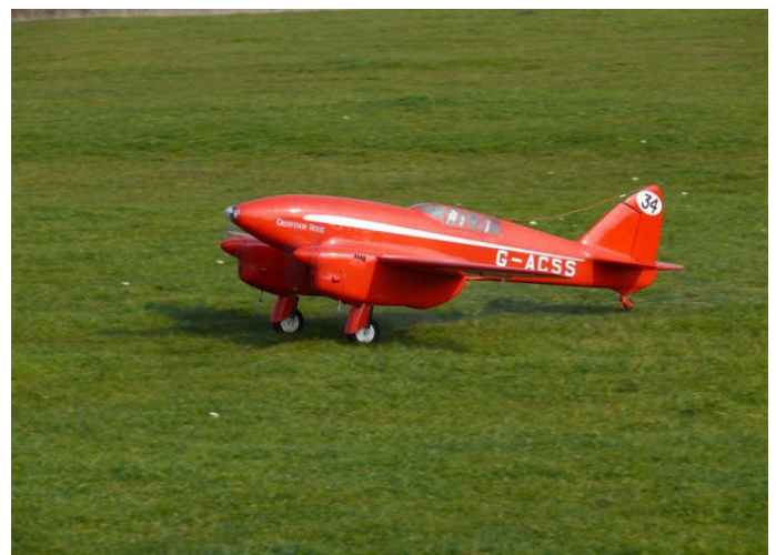
Mike Pugh's De Havilland 88 Comet about to take-off. Geoffrey De Havilland was determined that Britain was to win the prestigious England - Australia air race of 1934. The subject of this model, the scarlet and white "Grosvenor House" was the eventual winner flown by C.W.A. Scott and T. Campbell Black.

The 2007 edition of our club rules is attached. The Rules have been reviewed by the committee and amended to take into account changes noted in the BMFA rules and comments picked up at the AGM held in December 2006. There are very few changes on this occasion, but read them, please, to refresh your memory, and ensure that you have noted the changes which are shown in italics. A copy of the rules is posted on our Website and will be displayed in the club house.