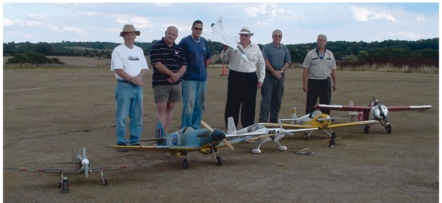
A recap of last year's result

Flying boundaries will be devised and marked out with tape on the day, with special regard for the safety of visitors. This may include departing from the customary arrangement of the pits if the wind requires it. There will be a large diagram on display for pilots to brief themselves. Even if you don't have something to offer for the "scale" competition, don't be shy about bringing your favourite model to put into the air for part of the day.