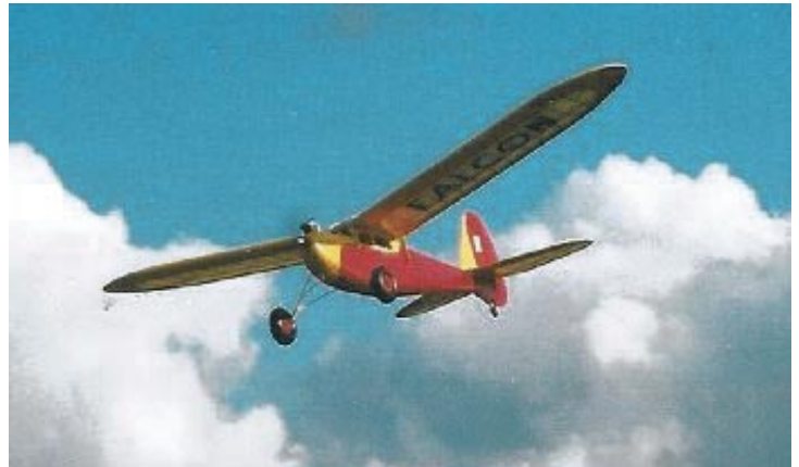
A reminder of summer flying

It is not too late to comment on these issues and the method of implementation, so if you have a view please make please make it known to a committee member.